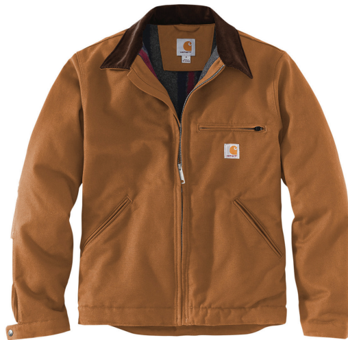
CARHARTT® Duck Detroit Jacket CT103828 | Adult Sizes: S—5XL | 2 Colors