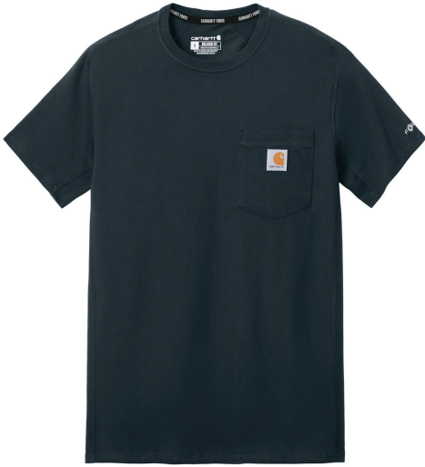
CARHARTT® Force® Short Sleeve Pocket T-Shirt CT106652 | Adult Sizes: S-4XL | 5 Colors