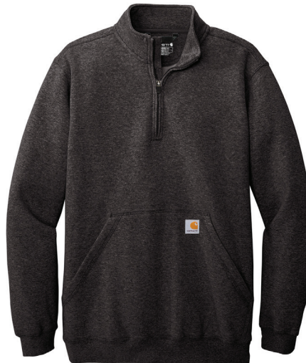
CARHARTT® Midweight 1/4-Zip Mock Neck Sweatshirt CT105294 | Adult Sizes: S-4XL | 4 Colors