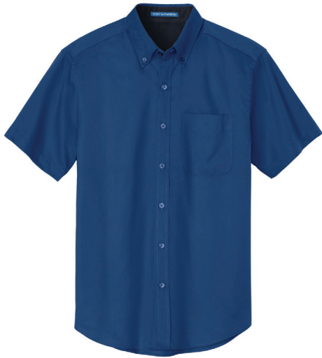
PORT AUTHORITY* Short Sleeve Easy Care Shirt S508 | Adult Sizes: XS-6XL | 16 Colors