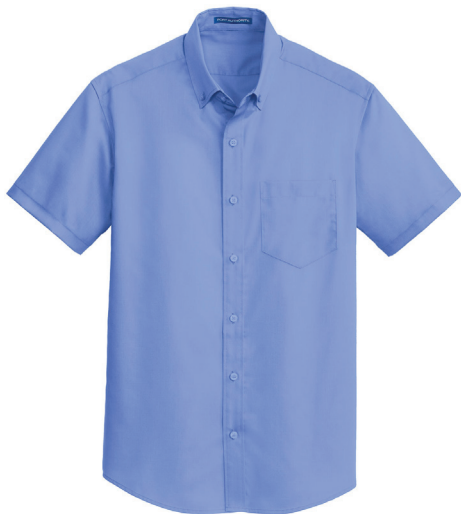
PORT AUTHORITY* Short Sleeve SuperPro™ Twill Shirt S664 | Adult Sizes: XS-4XL | 7 Colors