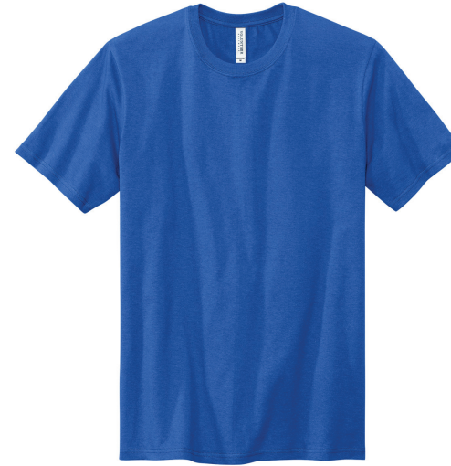
VOLUNTEER KNITWEAR™ All-American Tee VL100 | Adult Sizes: S-4XL | 11 Colors