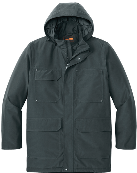
CORNERSTONE® Elements Insulated Parka CSJ10 | Adult Sizes: XS—4XL | 3 Colors