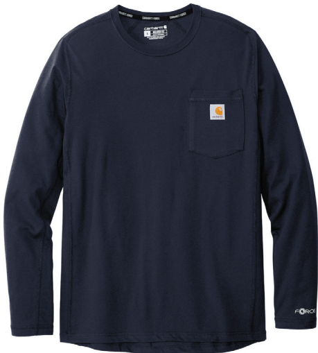
CARHARTT® Force® Long Sleeve Pocket T-Shirt CT106656 | Adult Sizes: S-4XL | 4 Colors