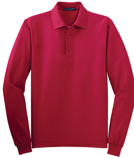
PORT AUTHORITY® Silk Touch™ Long Sleeve Polo K500LS | Adult Sizes: XS–6XL | 8 Colors