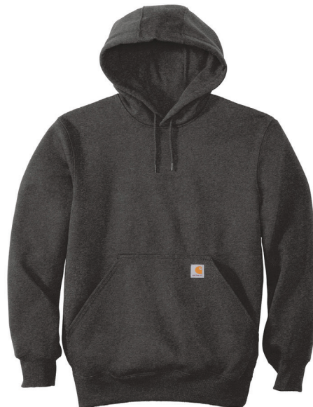
CARHARTT® Rain Defender® Paxton Heavyweight Hooded Sweatshirt CT100615 | Adult Sizes: S-4XL | 3 Colors