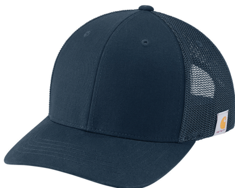
CARHARTT® Flexfit 110® Mesh Back Cap CT106577 | 4 Colors