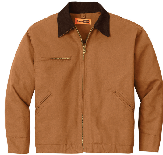
CORNERSTONE® Duck Cloth Work Jacket J763 | Adult Sizes: XS—6XL | 4 Colors