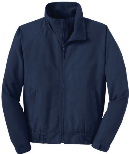
PORT AUTHORITY® Lightweight Charger Jacket J329 | Adult Sizes: XS—6XL | 2 Colors