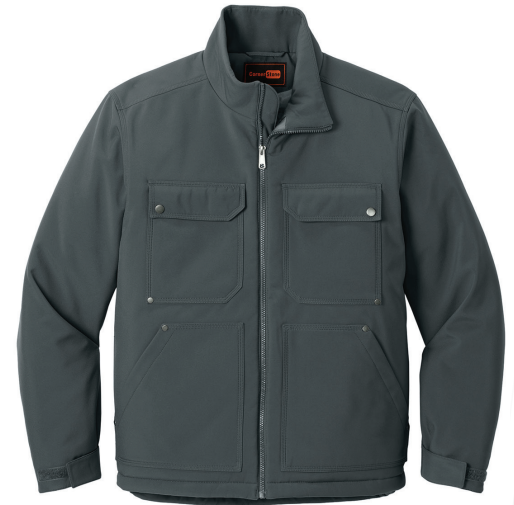
CORNERSTONE® Insulated Workwear Soft Shell CSJ75 | Adult Sizes: XS—4XL | 2 Colors