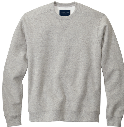
VOLUNTEER KNITWEAR™ Chore Fleece Crewneck VL130 | Adult Sizes: S-4XL | 2 Colors