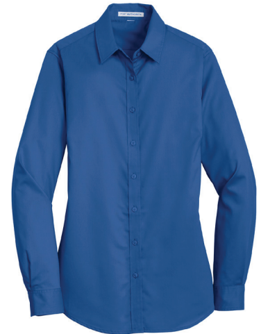
PORT AUTHORITY* Women's SuperPro™ Twill Shirt L663 | Women's Sizes: XS-4XL | 8 Colors