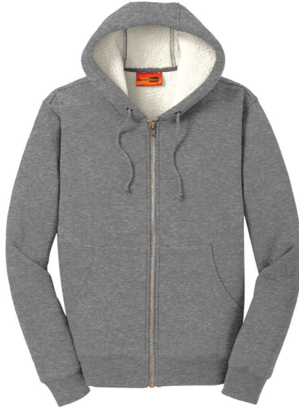
CORNERSTONE® Heavyweight Sherpa-Lined Hooded Fleece Jacket CS625 | Adult Sizes: XS—6XL | 3 Colors