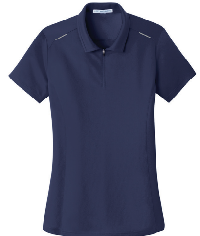
PORT AUTHORITY® Women's Pinpoint Mesh Zip Polo LS580 | Women's Sizes: XS—4XL | 4 Colors