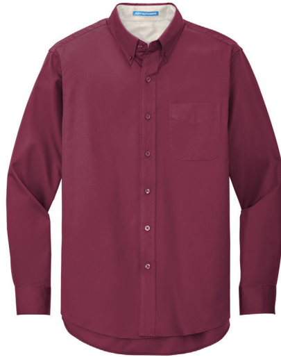
PORT AUTHORITY* Long Sleeve Easy Care Shirt S608 | Adult Sizes: XS-6XL | 21 Colors