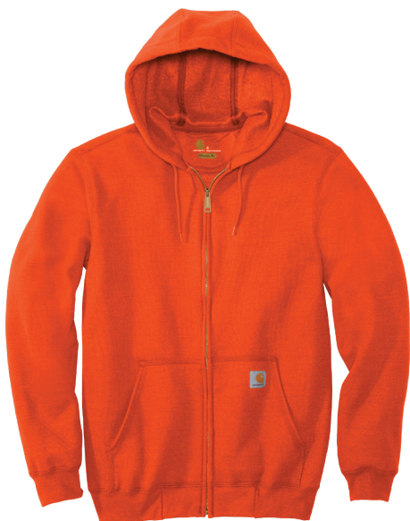
CARHARTT* Midweight Hooded Zip-Front Sweatshirt CTK122 | Adult Sizes: S-4XL | 7 Colors