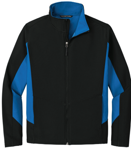
PORT AUTHORITY® Core Colorblock Soft Shell Jacket J318 | Adult Sizes: XS—4XL | 4 Colors