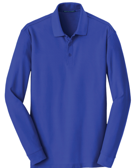
PORT AUTHORITY* Dry Zone® UV Micro-Mesh Long Sleeve Polo K110LS | Adult Sizes: XS—4XL | 6 Colors