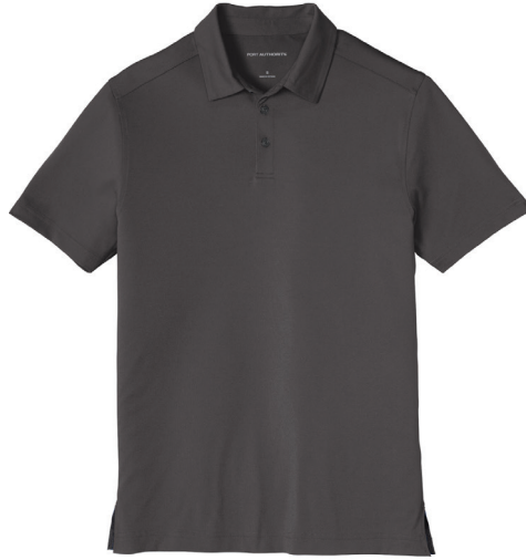
PORT AUTHORITY* City Stretch Polo K682 | Adult Sizes: XS—4XL | 6 Colors