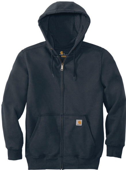
CARHARTT® Rain Defender® Paxton Heavyweight Hooded Zip-Front Sweatshirt CT100614 | Adult Sizes: S–4XL | 3 Colors