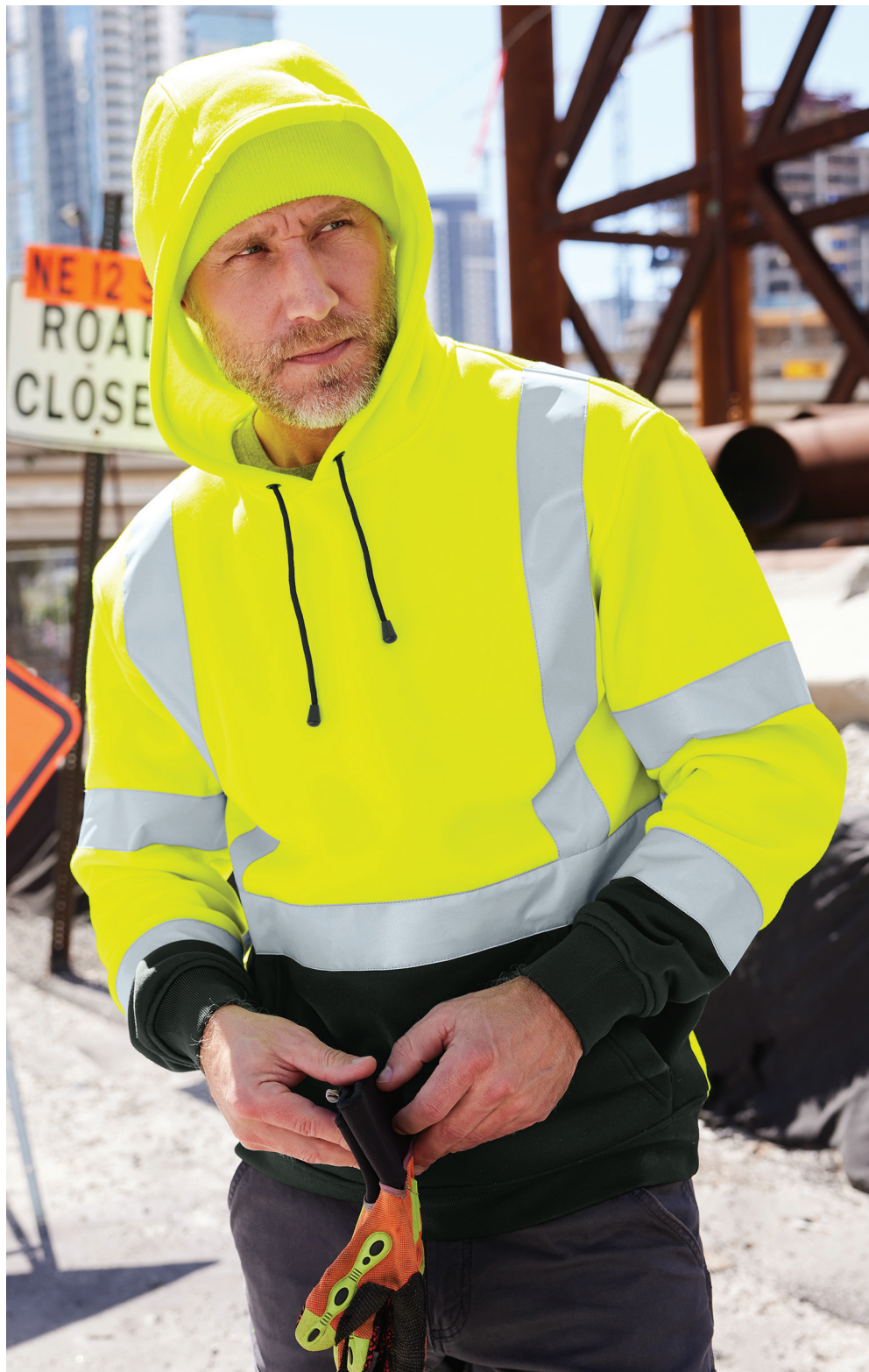
CORNERSTONE® ANSI 107 Class 3 Heavy-Duty Fleece Pullover Hoodie CSF301 | Adult Sizes: M—5XL | 2 Colors