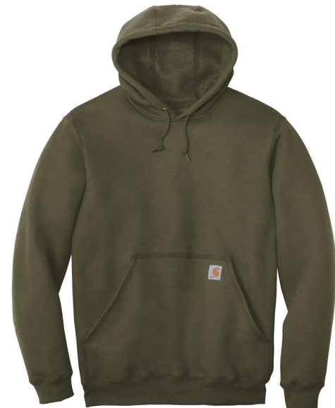
CARHARTT® Midweight Hooded Sweatshirt CTK121 | Adult Sizes: S-4XL | 7 Colors