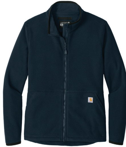
CARHARTT® Women's Textured Full-Zip Fleece Jacket CT106419 | Women's Sizes: XS–2XL | 4 Colors