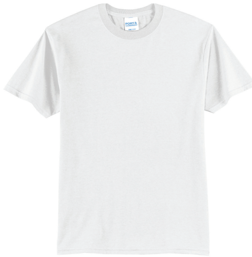
PORT & COMPANY® Core Blend Tee PC55 | Adult Sizes: S—6XL | 35 Colors