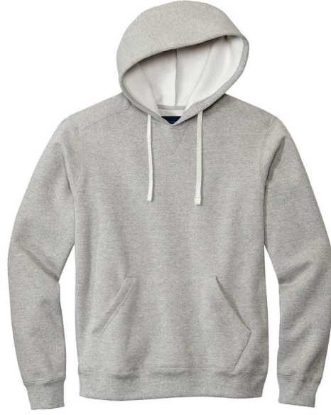
VOLUNTEER KNITWEAR™ Chore Fleece Pullover Hoodie VL130H | Adult Sizes: S-4XL | 4 Colors