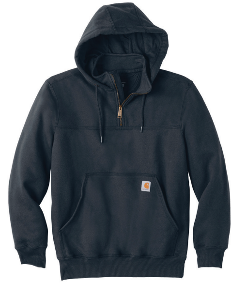
CARHARTT® Rain Defender® Paxton Heavyweight Hooded Zip Mock Sweatshirt CT100617 | Adult Sizes: S-4XL | 3 Colors