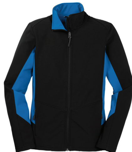
PORT AUTHORITY® Women's Core Colorblock Soft Shell Jacket L318 | Women's Sizes: XS—4XL | 2 Colors