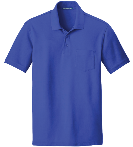
PORT AUTHORITY* Dry Zone® UV Micro-Mesh Pocket Polo K110P | Adult Sizes: XS—4XL | 5 Colors