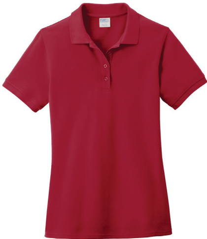
PORT & COMPANY* Women's Combed Ring Spun Pique Polo LKP1500 | Women's Sizes: XS—4XL | 2 Colors