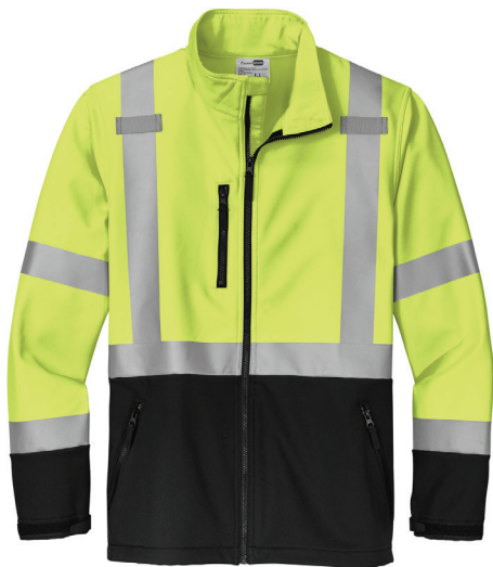
CORNERSTONE® ANSI 107 Class 3 Soft Shell Jacket CSJ503 | Adult Sizes: XS—5XL | 1 Color