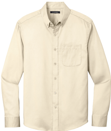
PORT AUTHORITY® Long Sleeve SuperPro React™ Twill Shirt W808 | Adult Sizes: XS—4XL | 18 Colors