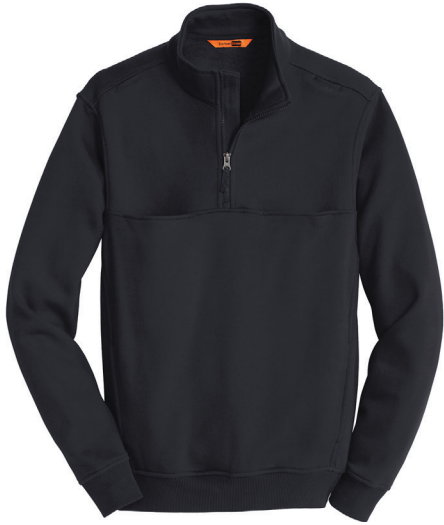
CORNERSTONE® 1/2-Zip Job Shirt CS626 | Adult Sizes: XS—4XL | 2 Colors