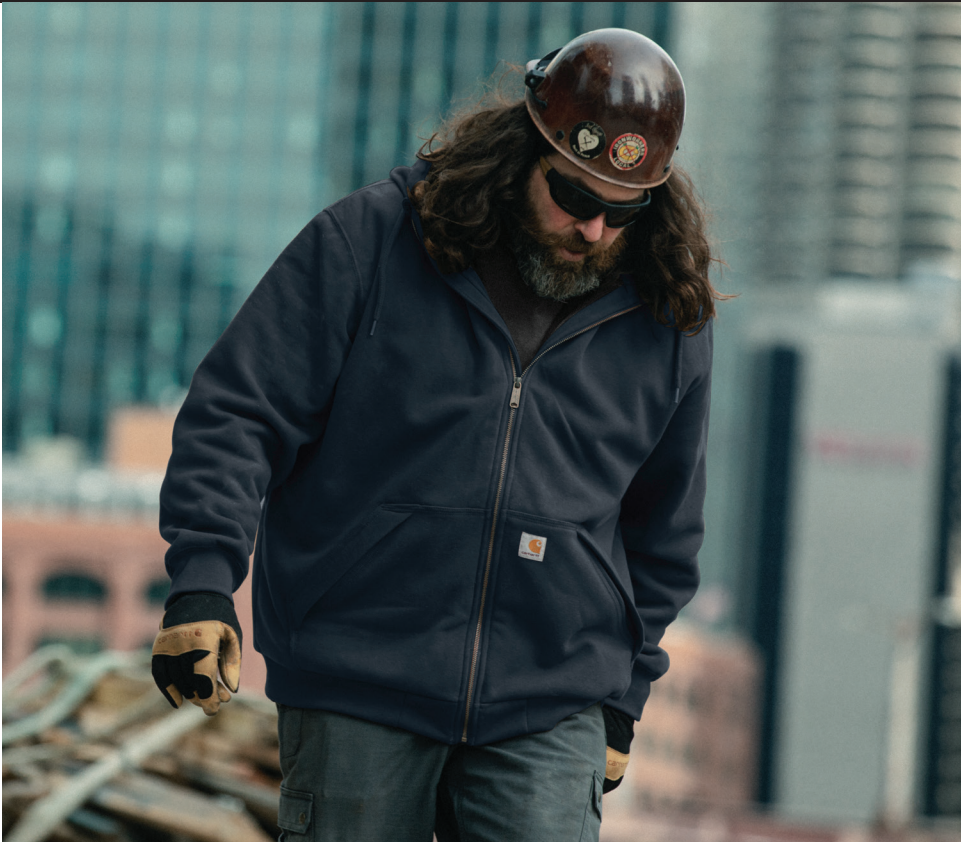
CARHARTT® Midweight Thermal-Lined Full-Zip Sweatshirt CT104078 | Adult Sizes: S-4XL | 3 Colors