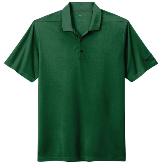
NIKE Dri-FIT Micro Pique 2.0 Polo NKDC1963 | Adult Sizes: XS-4XL & Tall Sizes: LT-4XLT | 20 Colors

Virtually carefree fabric • Wrinkle-resistance Stain-resistance • All-day comfort