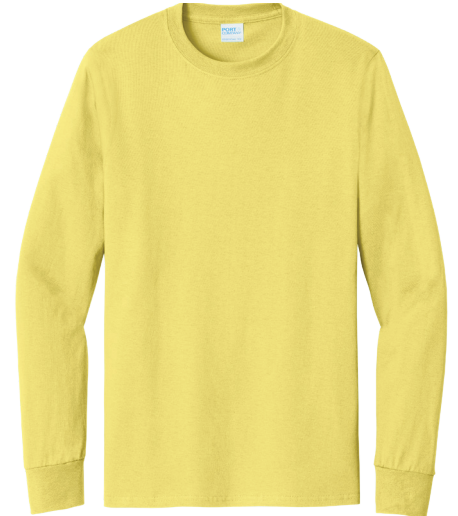
PORT & COMPANY* Long Sleeve Essential Tee PC61LS | Adult Sizes: S-4XL | 26 Colors