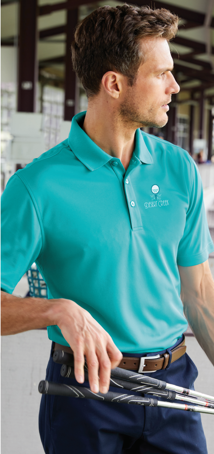
PORT AUTHORITY® Dry Zone® UV Micro-Mesh Polo K110 | Adult Sizes: XS-6XL | 16 Colors