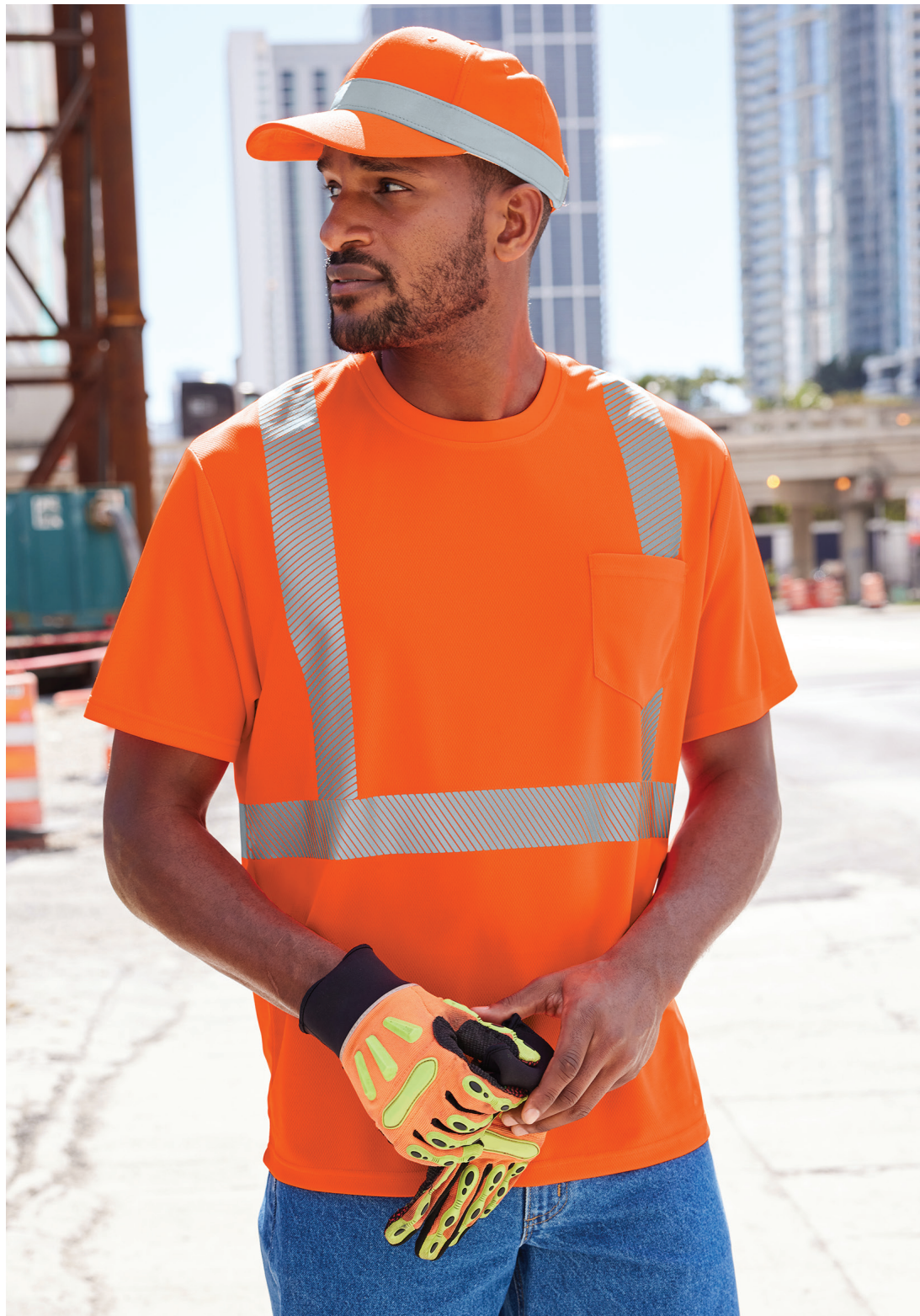
CORNERSTONE* ANSI 107 Class 2 Segmented Tape Tee CS204 | Adult Sizes: S-5XL | 2 Colors