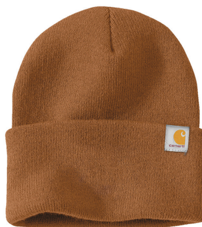
CARHARTT® Watch Cap 2.0 CT104597 | 9 Colors