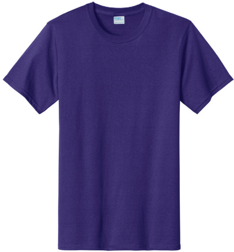
PORT & COMPANY* Essential Tee PC61 | Adult Sizes: S-6XL | 57 Colors