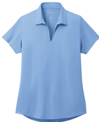
PORT AUTHORITY* Women's City Stretch Polo LK683 | Women's Sizes: XS—4XL | 6 Colors