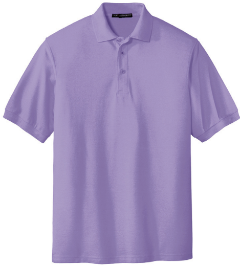
PORT AUTHORITY® Silk Touch™ Polo K500 | Adult Sizes: XS–6XL | 34 Colors