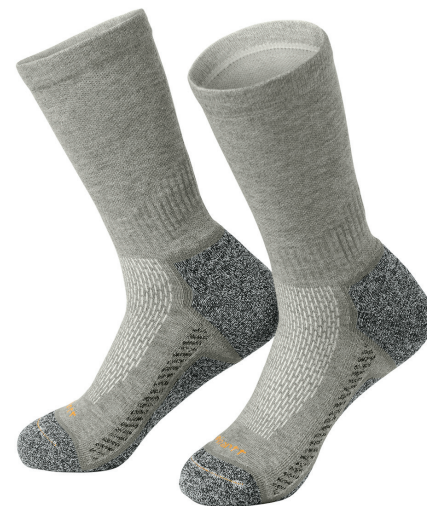
CARHARTT Force® Midweight Crew Sock (3-Pack) CTSC4223 | 3 Colors