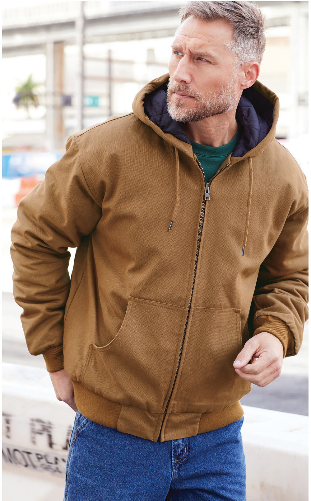
CORNERSTONE® Duck Cloth Hooded Work Jacket J763H | Adult Sizes: XS—6XL | 4 Colors