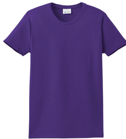
PORT & COMPANY* Women's Essential Tee LPC61 | Women's Sizes: XS-4XL | 15 Colors