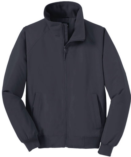
PORT AUTHORITY® Charger Jacket J328 | Adult Sizes: XS—6XL | 3 Colors