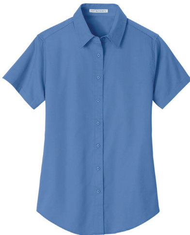
PORT AUTHORITY* Women's Short Sleeve Easy Care Shirt L508 | Women's Sizes: XS-6XL | 19 Colors