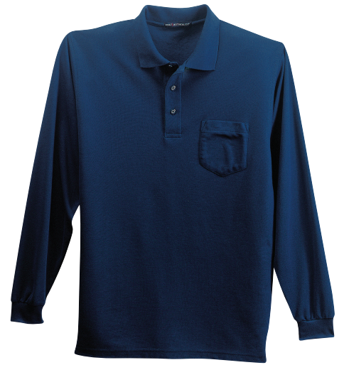
PORT AUTHORITY® Silk Touch™ Long Sleeve Polo with Pocket K500LSP | Adult Sizes: XS–4XL | 2 Colors