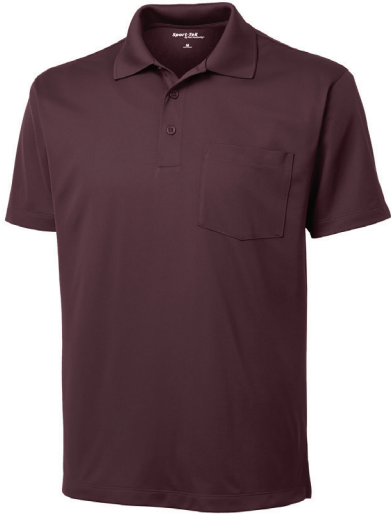
SPORT-TEK® Micropique Sport-Wick® Pocket Polo ST651 | Adult Sizes: XS—4XL | 8 Colors