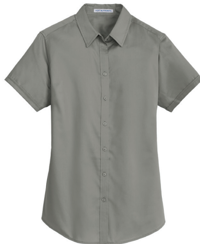
PORT AUTHORITY* Women's Short Sleeve SuperPro™ Twill Shirt L664 | Women's Sizes: XS-4XL | 7 Colors