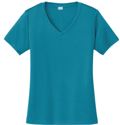
SPORT-TEK® Women's PosiCharge® Competitor™ V-Neck Tee LST353 | Women's Sizes: XS—4XL | 16 Colors