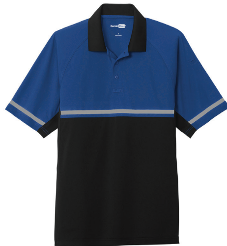
CORNERSTONE® Select Lightweight Snag-Proof Enhanced Visibility Polo CS423 | Adult Sizes: XS-4XL | 2 Colors