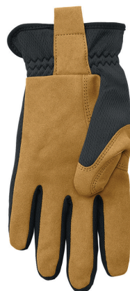
CARHARTT® High-Dexterity Open-Cuff Glove CTGD0794 | 1 Color