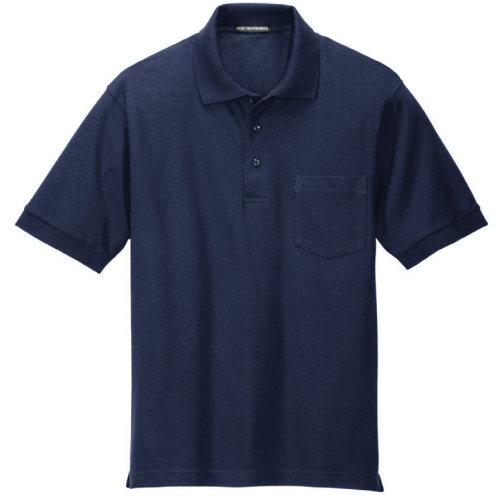
PORT AUTHORITY® Silk Touch™ Polo with Pocket K500P | Adult Sizes: XS–6XL | 9 Colors