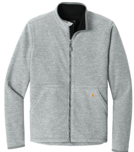
CARHARTT® Textured Full-Zip Fleece Jacket CT106416 | Adult Sizes: S-3XL | 4 Colors