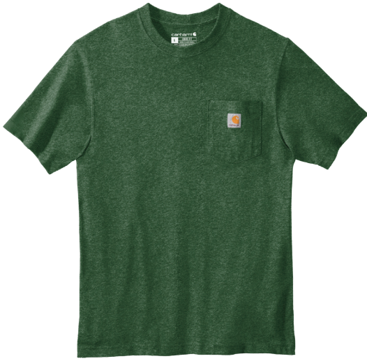
CARHARTT® Workwear Pocket Short Sleeve T-Shirt CTK87 | Adult Sizes S-4XL | 11 Colors