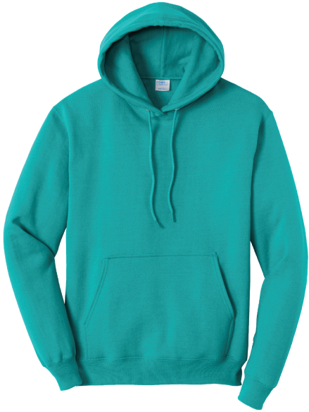
PORT & COMPANY® Core Fleece Pullover Hooded Sweatshirt PC78H | Adult Sizes: S-4XL | 60 Colors