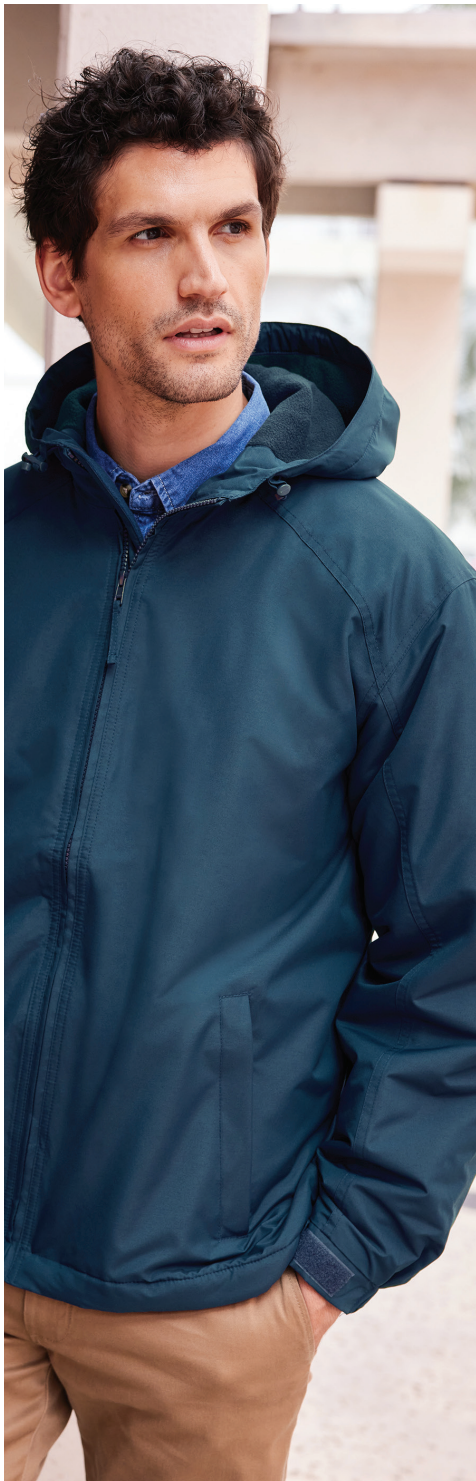
PORT AUTHORITY* Hooded Charger Jacket J327 | Adult Sizes: XS—4XL | 3 Colors