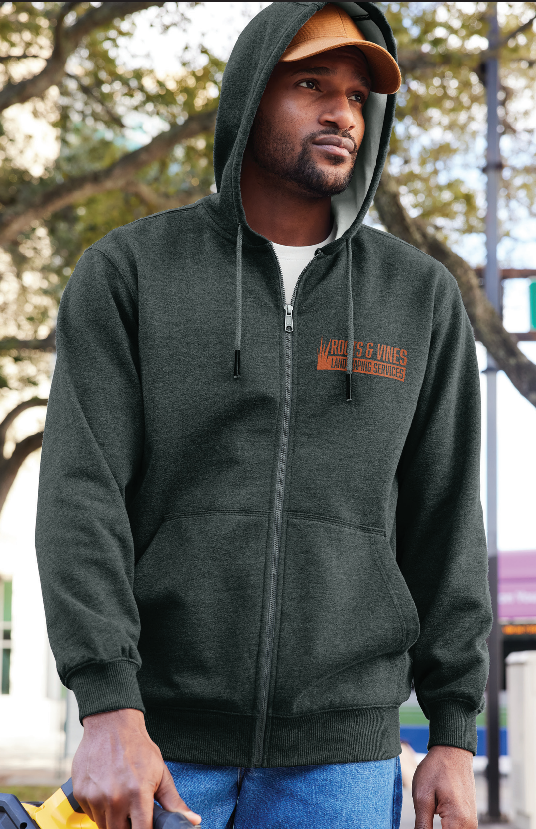
CORNERSTONE® Tough Fleece Full-Zip Hoodie CSF631 | Adult Sizes: XS—6XL | 3 Colors