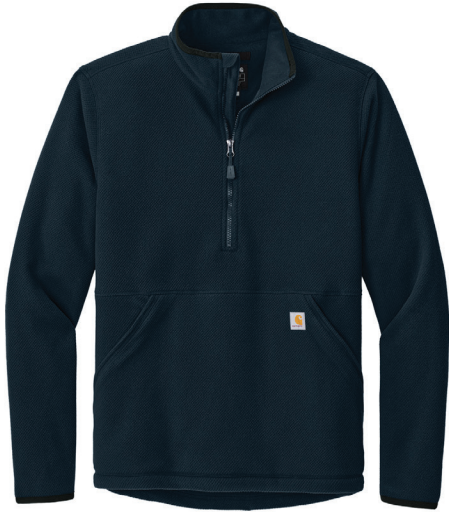
CARHARTT® Textured 1/2-Zip Fleece Jacket CT106417 | Adult Sizes: S–3XL | 4 Colors