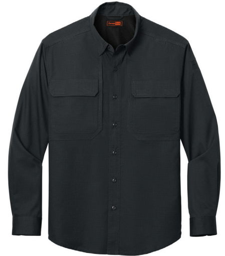
CORNERSTONE® Long Sleeve Select Tactical Shirt CSW176 | Adult Sizes: XS—4XL | 3 Colors