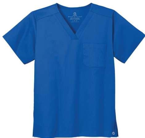
WINK* Unisex WorkFlex Chest Pocket V-Neck Top WW3160 | Unisex Sizes: 2XS—5XL | 8 Colors