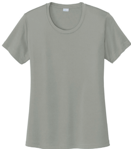
SPORT-TEK® Women's PosiCharge® Competitor™ Tee LST350 | Women's Sizes: XS—4XL | 27 Colors