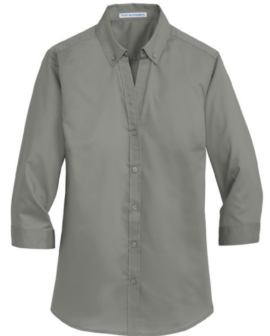
PORT AUTHORITY* Women's 3/4-Sleeve SuperPro™ Twill Shirt L665 | Women's Sizes: XS-4XL | 8 Colors