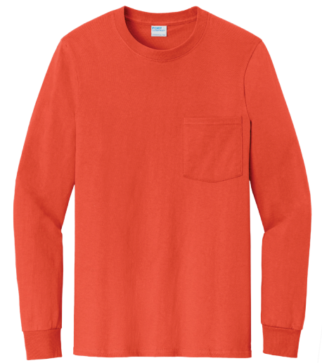
PORT & COMPANY* Long Sleeve Essential Pocket Tee PC61LSP | Adult Sizes: S-4XL | 12 Colors