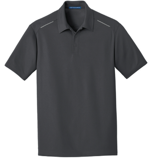
PORT AUTHORITY® Pinpoint Mesh Polo K580 | Adult Sizes: XS—4XL