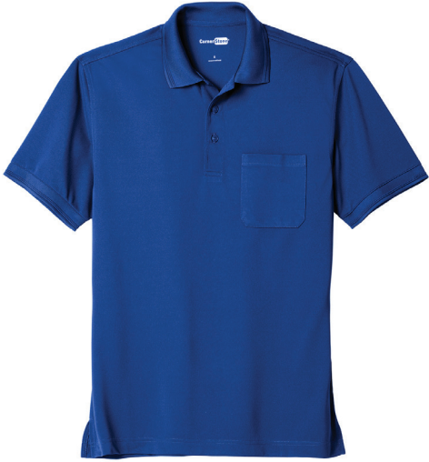
CORNERSTONE® Industrial Snag-Proof Pique Pocket Polo CS4020P | Adult Sizes: XS—6XL | 7 Colors