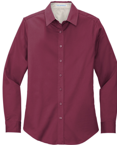
PORT AUTHORITY* Women's Long Sleeve Easy Care Shirt L608 | Women's Sizes: XS-6XL | 22 Colors