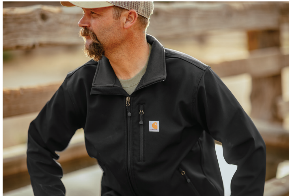
CARHARTT® Crowley Soft Shell Jacket CT102199 | Adult Sizes: S–3XL | 4 Colors