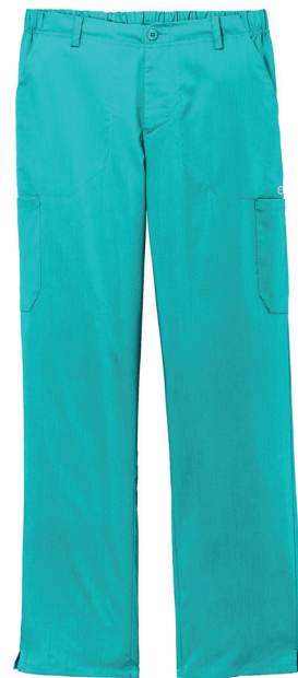
WINK* Men's Premiere Flex™ Cargo Pant WW5058 | Adult Sizes: XS—5XL | 8 Colors