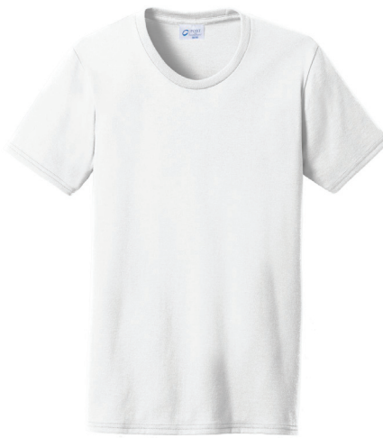
PORT & COMPANY® Women's Core Blend Tee LPC55 | Women's Sizes: XS—4XL | 7 Colors