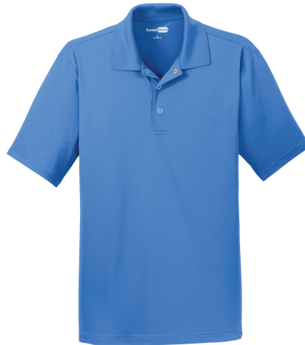
CORNERSTONE® Micropique Gripper Polo CS421 | Adult Sizes: XS—6XL