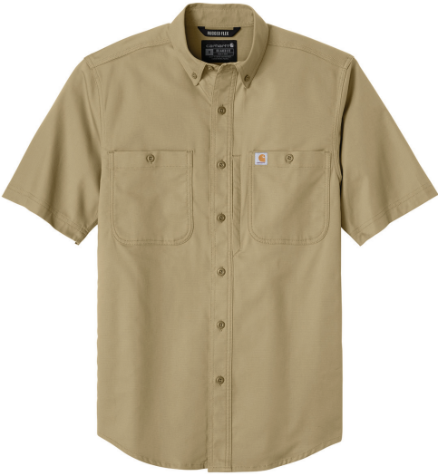
CARHARTT® Rugged Professional™ Series Short Sleeve Shirt CT106688 | Adult Sizes: S—4XL | 3 Colors