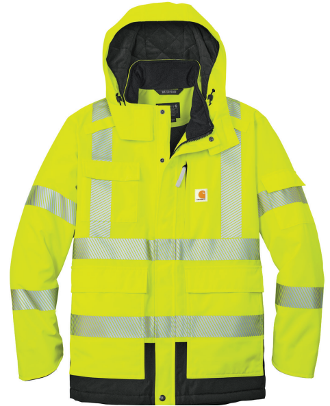
CARHARTT® ANSI 107 Class 3 Waterproof Heavyweight Insulated Jacket

CT106694 | Adult Sizes: XS–4XL | 1 Color