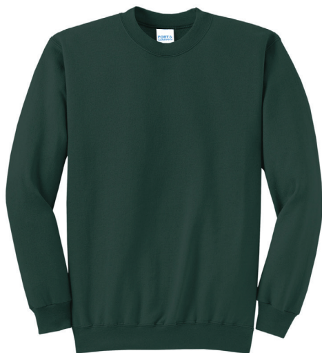
PORT & COMPANY* Core Fleece Crewneck Sweatshirt PC78 | Adult Sizes: S-4XL | 25 Colors