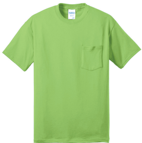
PORT & COMPANY* Core Blend Pocket Tee PC55P | Adult Sizes: S-6XL | 17 Colors