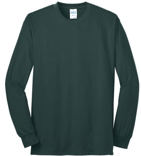
PORT & COMPANY® Long Sleeve Core Blend Tee PC55LS | Adult Sizes: S—6XL | 19 Colors