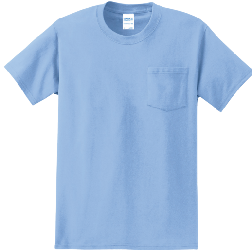
PORT & COMPANY* Essential Pocket Tee PC61P | Adult Sizes: S-4XL | 19 Colors