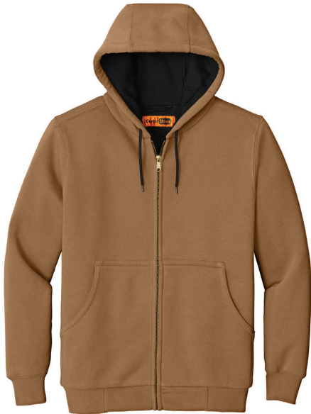
CORNERSTONE® Heavyweight Full-Zip Hooded Sweatshirt with Thermal Lining CS620 | Adult Sizes XS—6XL | 4 Colors