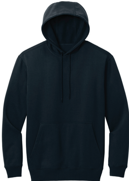
CORNERSTONE® Tough Fleece Pullover Hoodie CSF630 | Adult Sizes: XS-6XL | 5 Colors