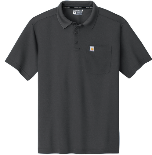
CARHARTT® Force® Snag-Resistant Pocket Polo CT106880 | Adult Sizes: S-4XL | 6 Colors