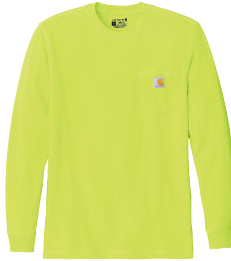
CARHARTT® Workwear Pocket Long Sleeve T-Shirt CTK126 | Adult Sizes: S-4XL | 6 Colors