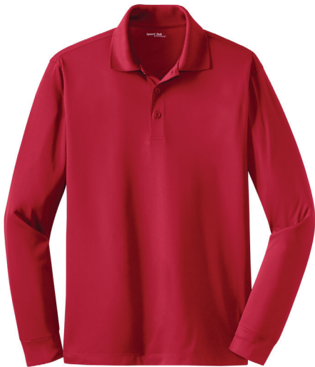
SPORT-TEK® Long Sleeve Micropique Sport-Wick® Polo ST657 | Adult Sizes: XS—4XL | 9 Colors