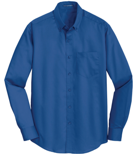
PORT AUTHORITY* SuperPro™ Twill Shirt S663 | Adult Sizes: XS-4XL | 8 Colors