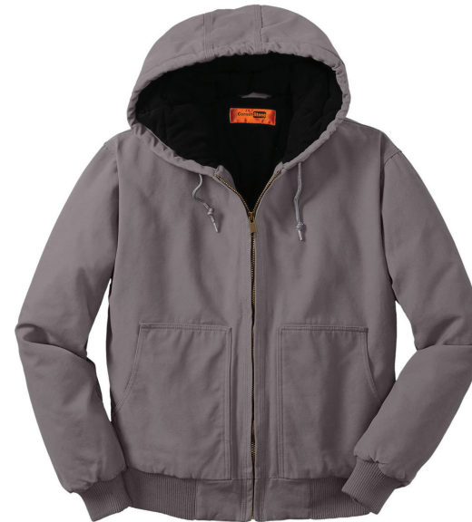
CORNERSTONE® Washed Duck Cloth Insulated Hooded Work Jacket CSJ41 | Adult Sizes: XS—6XL | 4 Colors