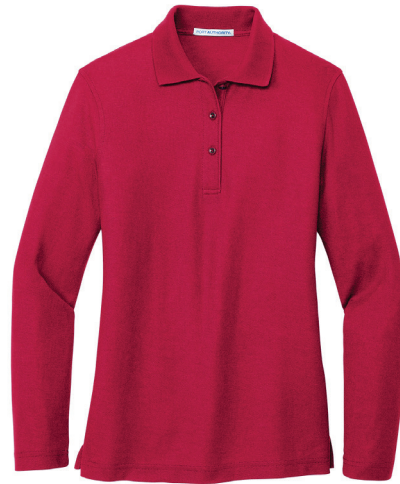
PORT AUTHORITY® Women's Silk Touch™ Long Sleeve Polo L500LS | Women's Sizes: XS–4XL | 7 Colors