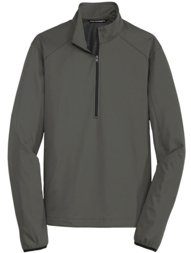
PORT AUTHORITY® Active 1/2-Zip Soft Shell Jacket J716 | Adult Sizes: XS—4XL | 3 Colors