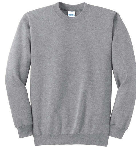
PORT & COMPANY® Essential Fleece Crewneck Sweatshirt PC90 | Adult Sizes: S—4XL | 16 Colors