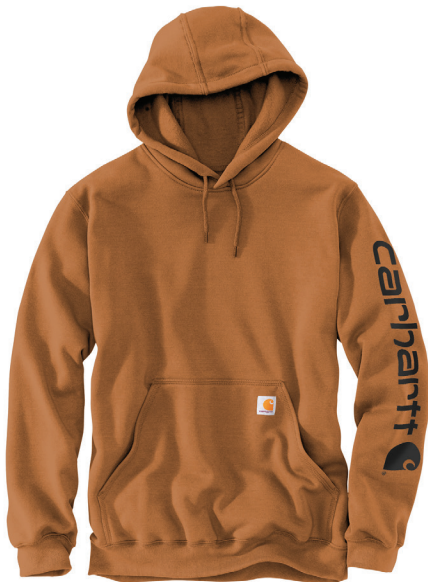
CARHARTT® Midweight Hooded Logo Sweatshirt CTK288 | Adult Sizes: S-5XL | 5 Colors