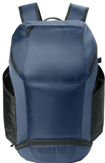
SPORT-TEK® Club Rec Pack BST201 | 3 Colors