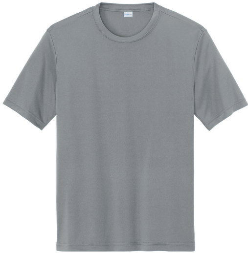
SPORT-TEK® PosiCharge® Competitor™ Tee ST350 | Adult Sizes: XS—4XL | 35 Colors