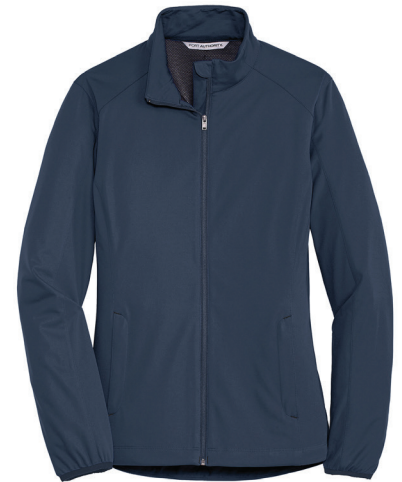
PORT AUTHORITY® Women's Active Soft Shell Jacket L717 | Women's Sizes: XS-4XL | 4 Colors