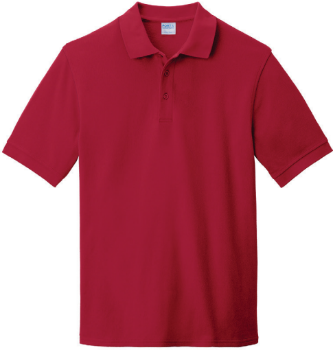
PORT & COMPANY* Combed Ring Spun Pique Polo KP1500 | Adult Sizes: XS—4XL | 6 Colors