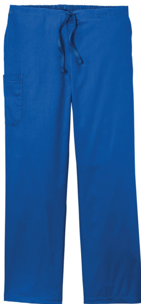
WINK* Unisex WorkFlex Cargo Pant WW3150 | Unisex Sizes: 2XS—5XL | 8 Colors