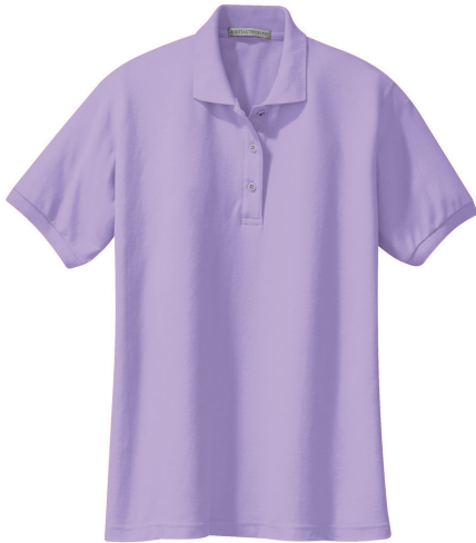
PORT AUTHORITY® Women's Silk Touch™ Polo L500 | Women's Sizes: XS–6XL | 34 Colors