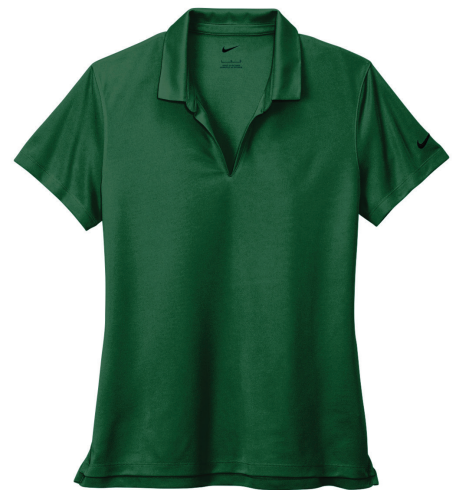
NIKE Women's Dri-FIT Micro Pique 2.0 Polo NKDC1991 | Women's Sizes: S-2XL | 20 Colors