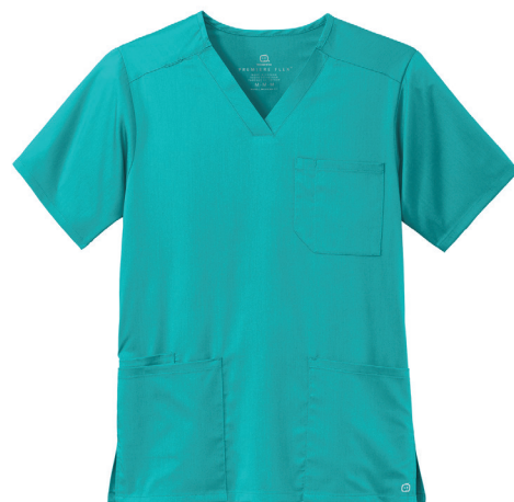
WINK* Men's Premiere Flex™ V-Neck Top WW5068 | Adult Sizes: XS—5XL | 8 Colors