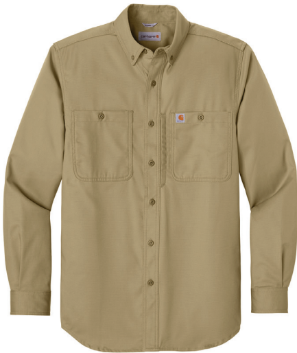
CARHARTT® Rugged Professional™ Series Long Sleeve Shirt CT106689 | Adult Sizes: S—4XL | 3 Colors