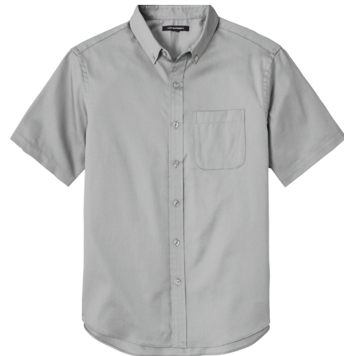
PORT AUTHORITY® Short Sleeve SuperPro React™ Twill Shirt W809 | Adult Sizes: XS-4XL | 17 Colors