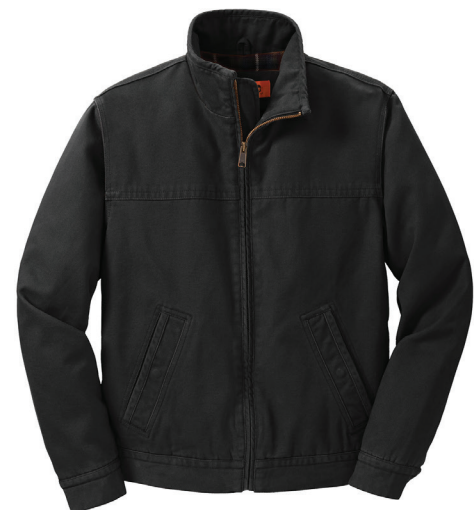
CORNERSTONE® Washed Duck Cloth Flannel-Lined Work Jacket CSJ40 | Adult Sizes: XS—6XL | 3 Colors