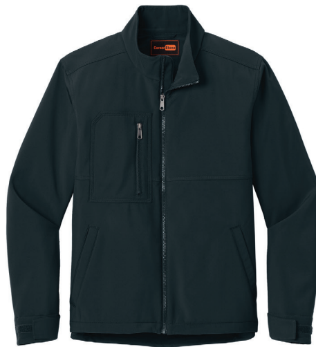
CORNERSTONE® Workwear Soft Shell CSJ70 | Adult Sizes: XS—4XL | 3 Colors