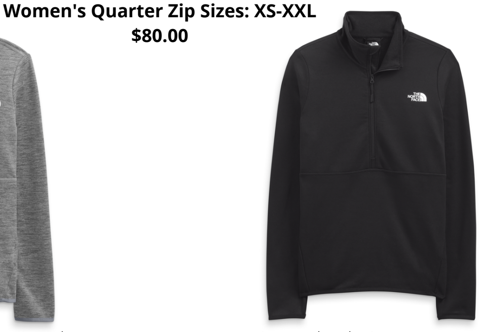
W. Canyonlands Quarter Zip Jacket A5GBEIK3 TNF Black