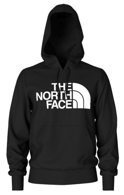
M. Half Dome Pullover Hoodie A7UNLKY4 TNF Black/TNF White

Men's Sizes: S-3XL Women's Sizes: XS-XXL $60.00