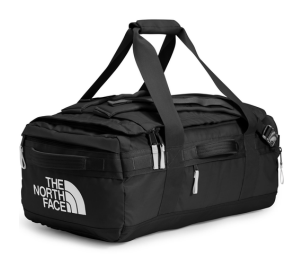
Base Camp Voyager Duffel 42L A52RQKY4 TNF Black $135.00