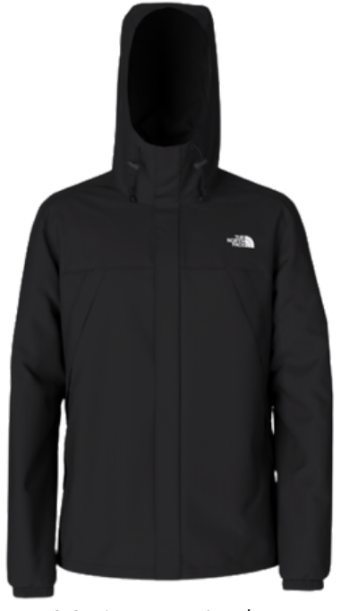
M. Antora Jacket A7QEYJK3 TNF Black

Standard fit. Waterproof, breathable, seam-sealed DryVent 2L shell with non-PFC DWR finish helps keep you dry. 100 percent windproof fabric. Alpine-style design with secure-zip hand pockets. Attached, three-piece hood with an adjustable cord lock. Stormflap with a hook-and-loop closure covers the center front zip. Elastic binding on cuffs. Side-hem adjust. Drop-tail hem. Heat transfer logo on left chest and back-right shoulder.