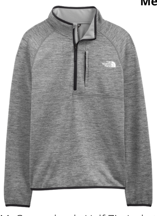
M. Canyonlands Half Zip Jacket A5G9WDYY TNF Medium Grey Heather