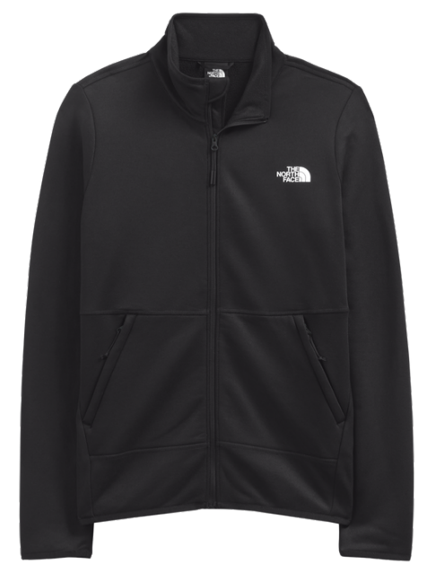
W. Canyonlands Full Zip Jacket A5GBDJK3 TNF Black