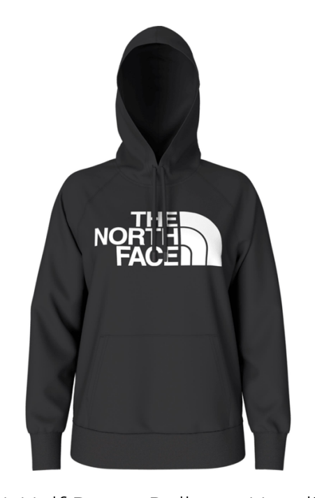
W. Half Dome Pullover Hoodie A7UNOKY4 TNF Black/TNF White