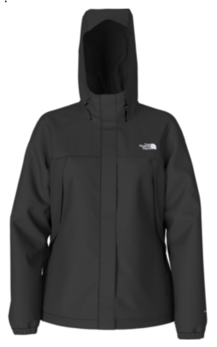
W. Antora Jacket A7QEUJK3 TNF Black

Men's Sizes: S-3XL $110.00 Women's Sizes: XS-XXL $110.00