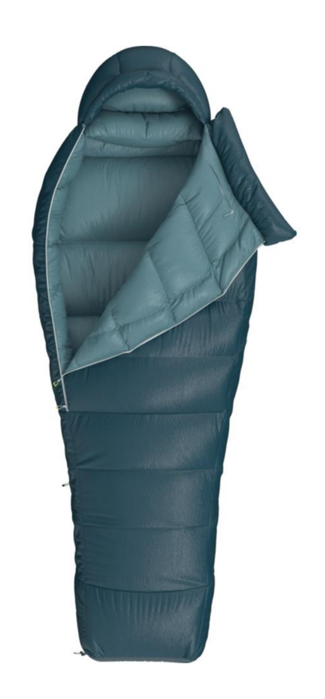
Trail Lite Down 20 A81CPP6C Blue Coral/Reef Waters $220.00