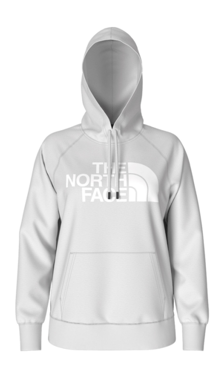
W. Half Dome Pullover Hoodie A7UNOGAV TNF Light Grey Heather/TNF White