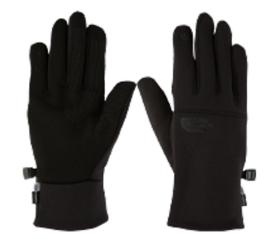
ETIP Recycled Gloves A4SHAJK3 TNF BLack $45.00