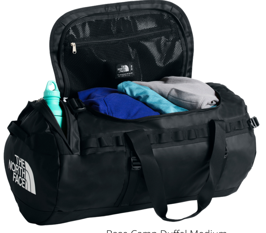
Base Camp Duffel Medium A52SAKY4 TNF Black/TNF White $149.00

It's not your average duffel bag. Made from a durable laminate material, the Base Camp Duffel is a bomber of a bag. Amply resilient to be rough around in-flight, or be transported up a mountain via a yak, this is one burly duffel bag. Intensive volume options provide ideal storage for weekend, or extended weekend trips lasting three or four days. New design includes redesigned straps and a separate compartment to stash your shoes or dirty laundry.