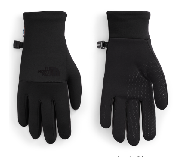
Women's ETIP Recycled Gloves A4SHBJK3 TNF Black $45.00