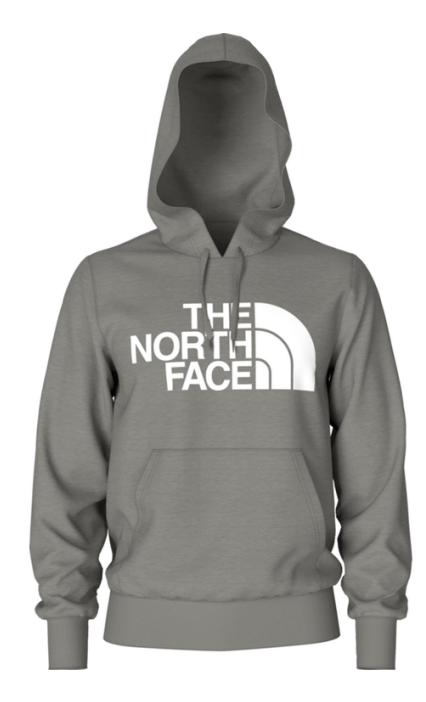
M. Half Dome Pullover Hoodie A7UNLGAZ TNF Medium Grey Heather/TNF White