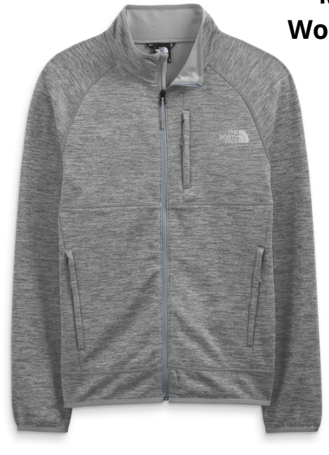
M. Canyonlands Full Zip Jacket A5G9VDYY TNF Medium Grey Heather

Men's Full Zip Sizes: S-3XL Women's Full Zip Sizes: XS-XXL $90.00