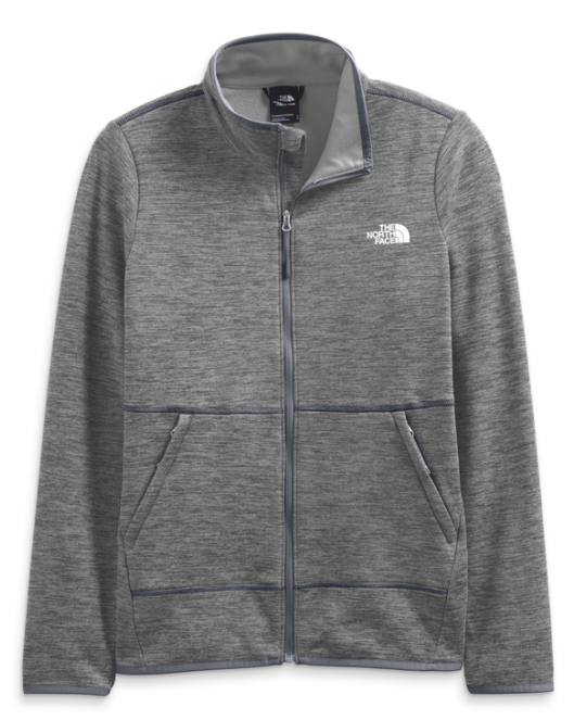
W. Canyonlands Full Zip Jacket A5GBDDYY TNF Medium Grey Heather