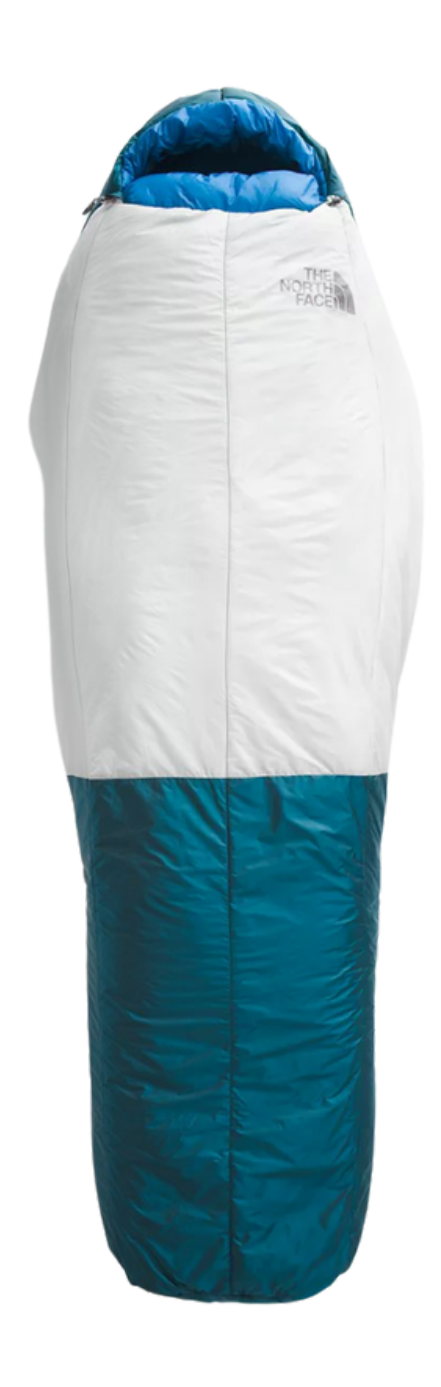
Cat's Meow Eco Bag A52DZ4K7 Banff Blue/Tin Grey $179.00

The evolution of the sleeping bag is here. With its minimalist, space-saving design, the 20°F (-7°C) Trail Lite Down 20 will help keep you warm while also being easy to fit in your pack.