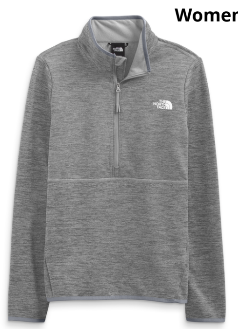
W. Canyonlands Quarter Zip Jacket A5GBEDYY TNF Medium Grey Heather