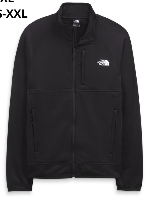
M. Canyonlands Full Zip Jacket A5G9VJK3 TNF Black