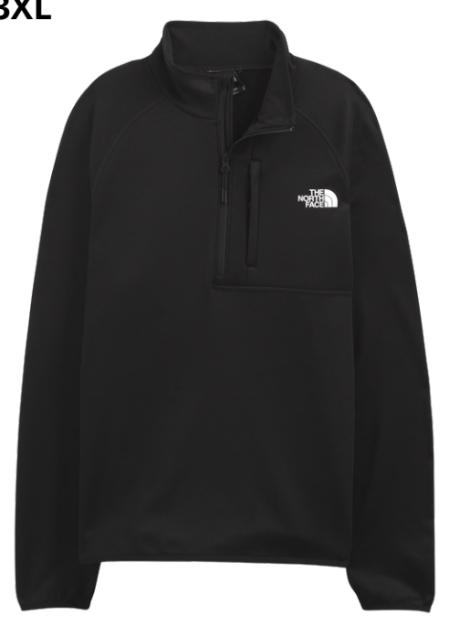
M. Canyonlands Half Zip Jacket A5G9WIK3 TNF Black