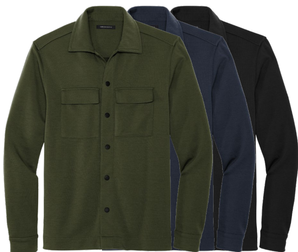
MERCER + METTLE Double-Knit Snap Front Jacket MM3004 Adult Sizes: XS-4XL | 3 colors