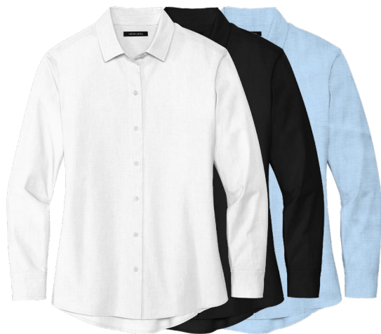
MERCER + METTLE Women's Long Sleeve Stretch Woven Shirt MM2001 Women's Sizes: XS-4XL | 4 colors