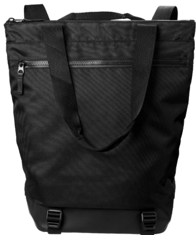
MERCER + METTLE Convertible Tote MMB202 1 color