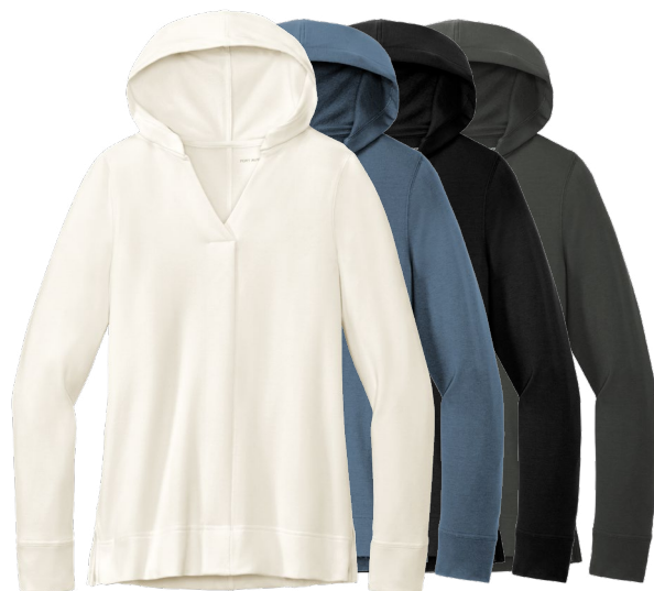
PORT AUTHORITY Ladies Microterry Pullover Hoodie LK826 Women's Sizes: XS-4XL | 4 colors