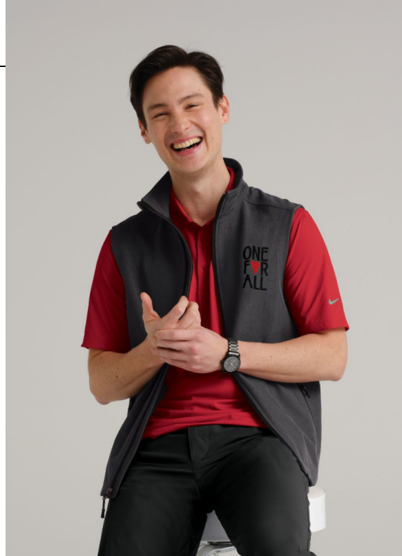
PORT AUTHORITY Core Soft Shell Vest J325 Adult Sizes: XS-4XL | 4 colors Worn with 883681