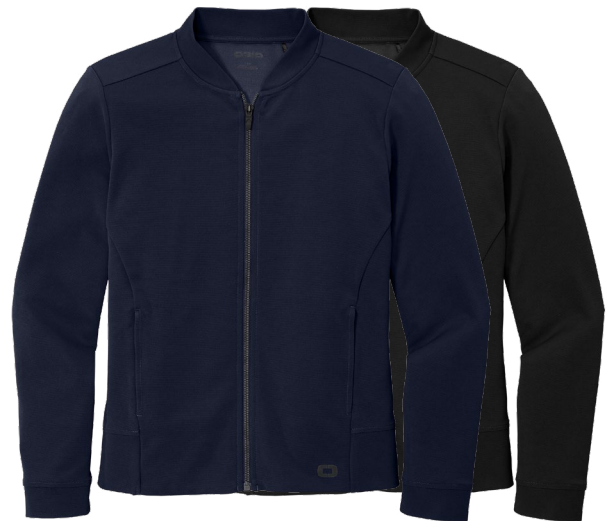
OGIO Ladies Hinge Full-Zip LOG820 Women's Sizes: XS-4XL | 3 colors