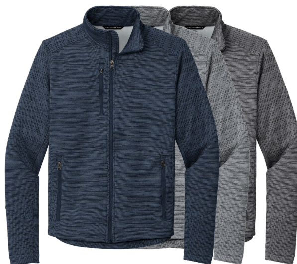
PORT AUTHORITY Digi Stripe Fleece Jacket F231 Adult Sizes: XS-4XL | 3 colors