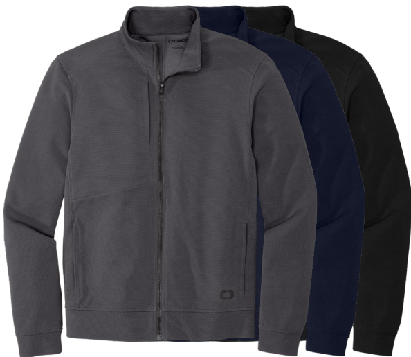
OGIO Hinge Full-Zip OG820 Adult Sizes: XS-4XL | 3 colors