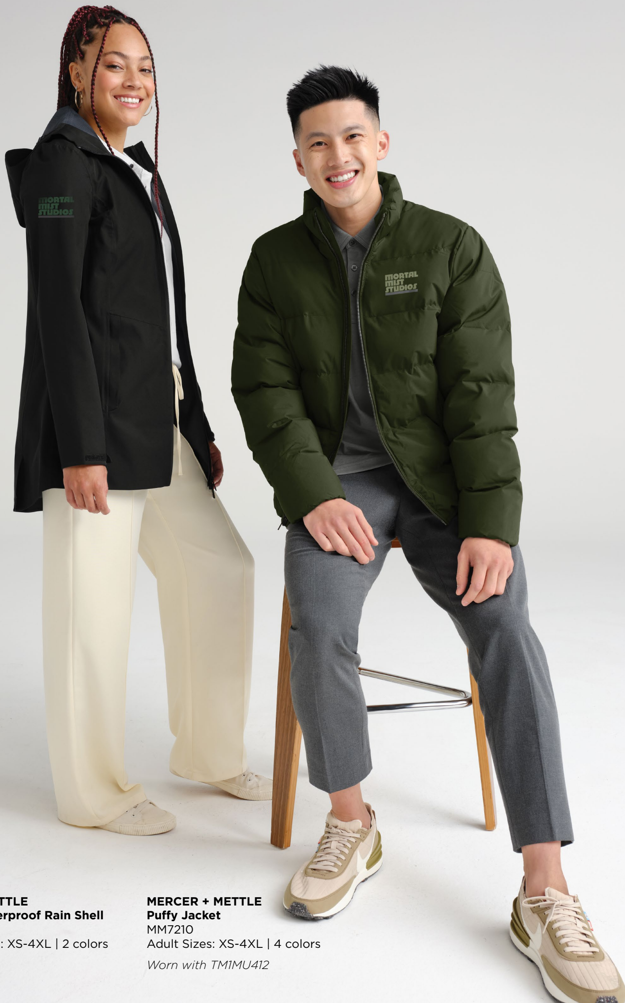
MERCER + METTLE Women's Waterproof Rain Shell MM7001 Women's Sizes: XS-4XL | 2 colors