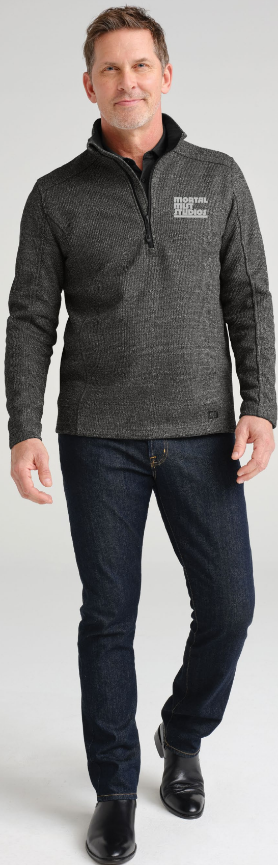
OGIO Grit Fleece 1/2-Zip OG729 Adult Sizes: XS-4XL | 2 colors Worn with TM1MY399