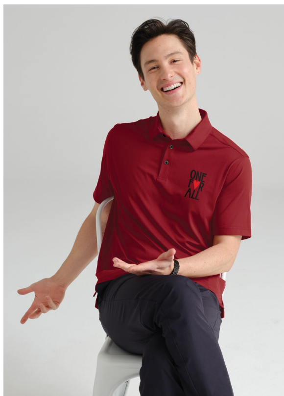
PORT AUTHORITY City Stretch Polo K682 Adult Sizes: XS-4XL | 6 colors