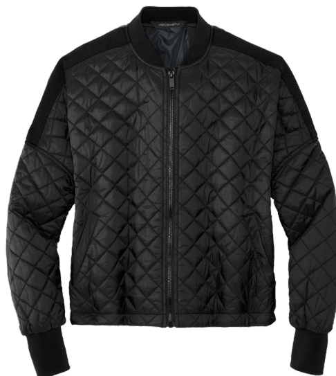
MERCER + METTLE Women's Boxy Quilted Jacket MM7201 Women's Sizes: XS-4XL | 1 color