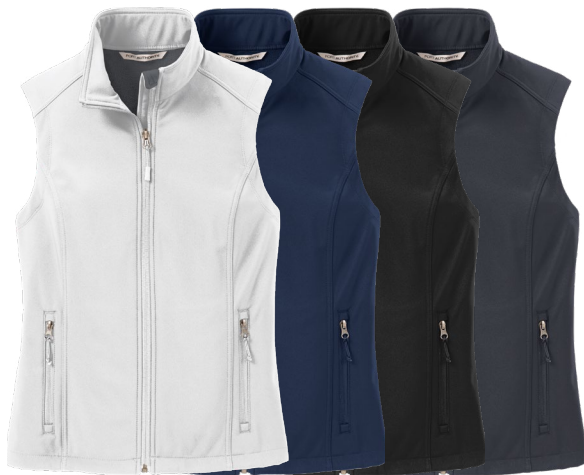
PORT AUTHORITY Ladies Core Soft Shell Vest L325 Women's Sizes: XS-4XL | 5 colors