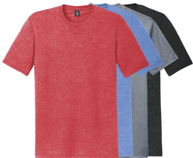
DISTRICT Perfect Tri Tee DM130 Adult Sizes: XS-4XL | 35 colors