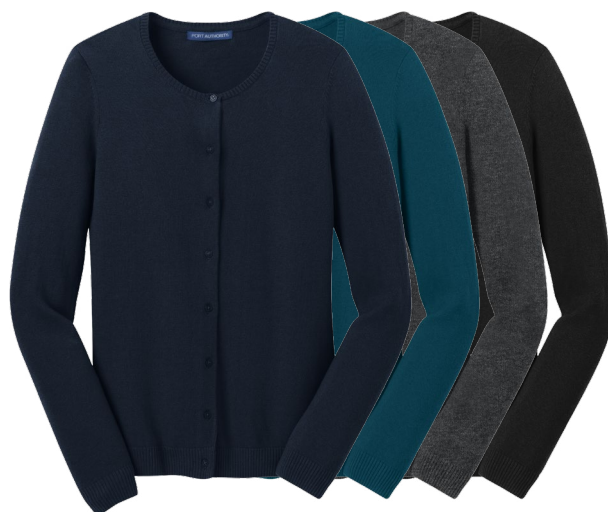
PORT AUTHORITY Ladies Cardigan Sweater LSW287 Women's Sizes: XS-4XL | 3 colors