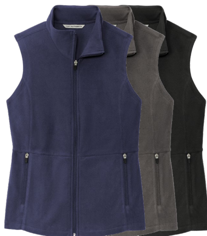
PORT AUTHORITY Ladies Accord Microfleece Vest L152 Women's Sizes: XS-4XL | 3 colors