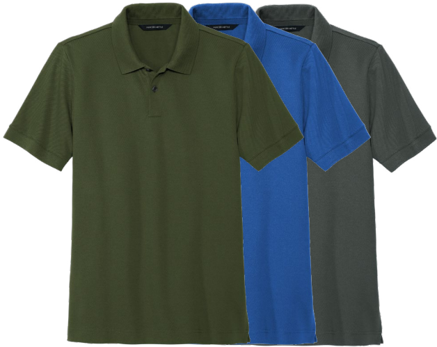
MERCER + METTLE Stretch Heavyweight Pique Polo MM1000 Adult Sizes: XS-4XL | 8 colors