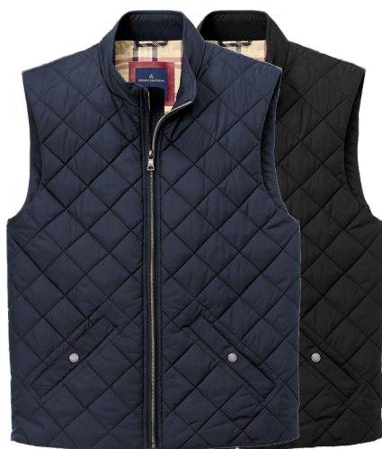
BROOKS BROTHERS Quilted Vest BB18602 Adult Sizes: XS-4XL | 2 colors