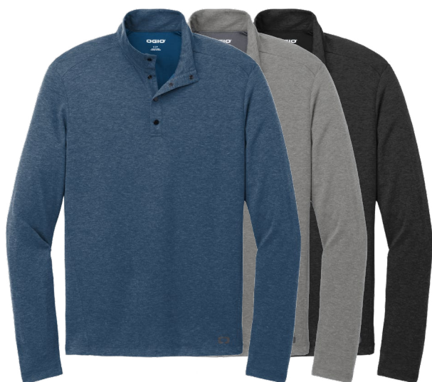
OGIO Command 1/4-Snap OG151 Adult Sizes: XS-4XL | 3 colors