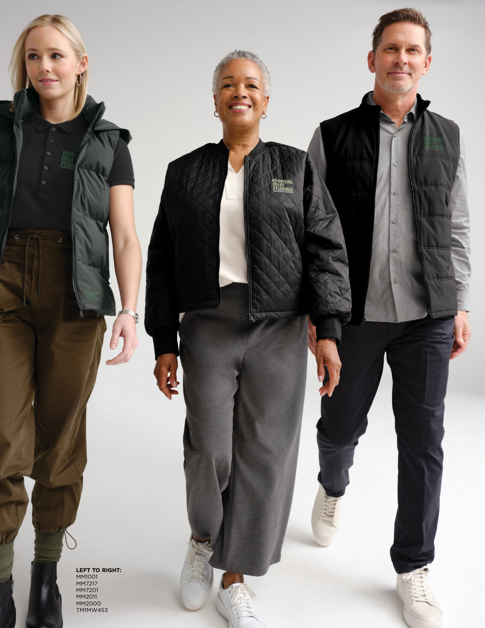
LEFT TO RIGHT: MM1001 MM7217 MM7201 MM2011 MM2000 TMIMW453