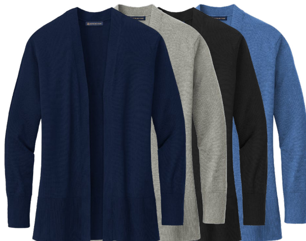
BROOKS BROTHERS Women's Cotton Stretch Long Cardigan Sweater BB18403 Women's Sizes: XS-4XL | 4 colors