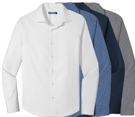
PORT AUTHORITY City Stretch Shirt W680 Adult Sizes: XS-4XL | 5 colors