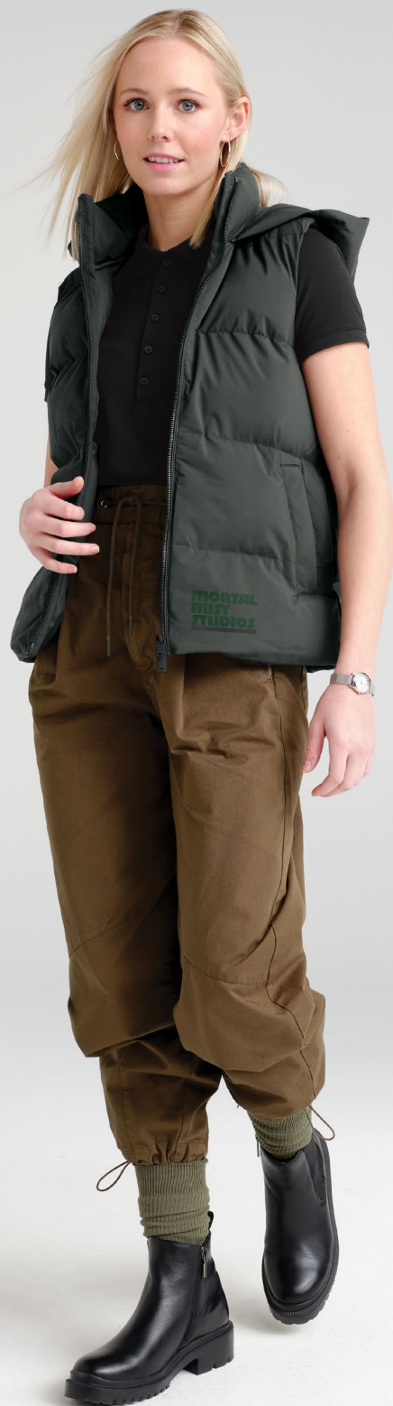
MERCER + METTLE Women's Stretch Heavyweight Pique Polo MM1001 Women's Sizes: XS-4XL | 8 colors