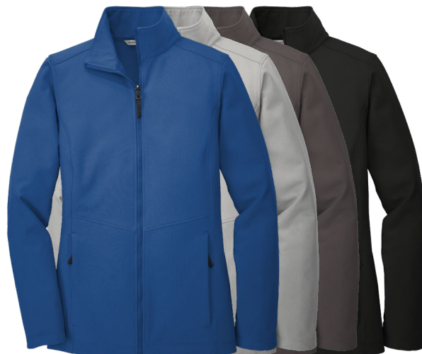
PORT AUTHORITY Ladies Collective Soft Shell Jacket L901 Women's Sizes: XS-4XL | 5 colors