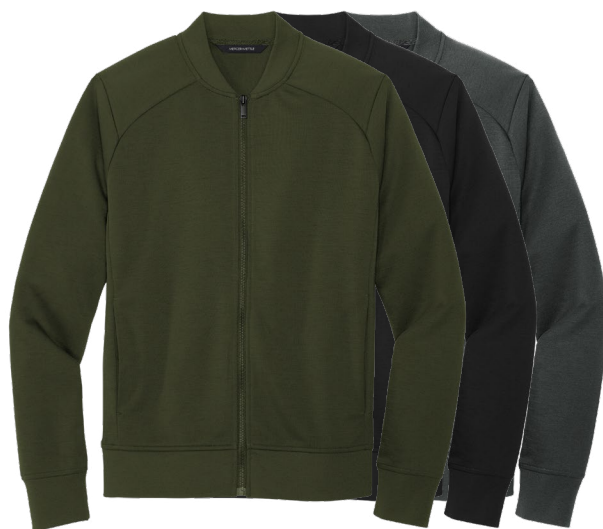
MERCER + METTLE Double-Knit Bomber MM3000 Adult Sizes: XS-4XL | 4 colors