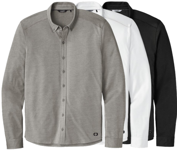
OGIO Code Stretch Long Sleeve Button-Up OG145 Adult Sizes: XS-4XL | 3 colors