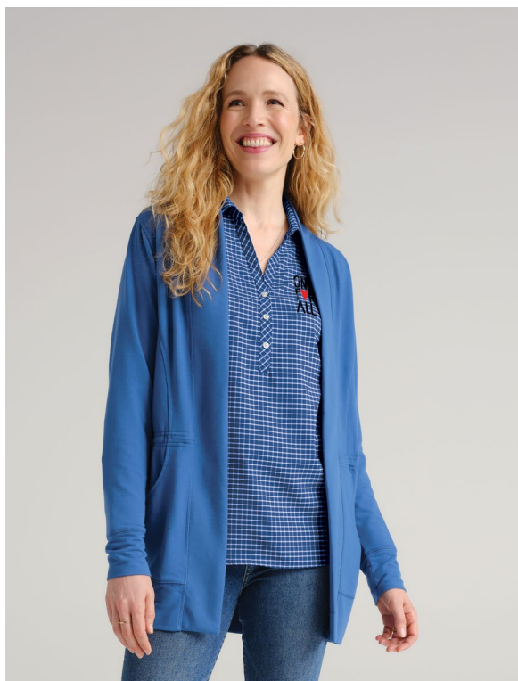
PORT AUTHORITY Ladies Microterry Cardigan LK825 Women's Sizes: XS-4XL | 4 colors Worn with LW680