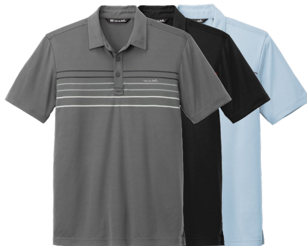
TRAVIS MATHEW Coto Performance Chest Stripe Polo TM1MY400 Adult Sizes: S-3XL | 3 colors