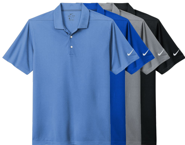
NIKE Dri-FIT Micro Pique 2.0 Polo NKDC1963 Adult Sizes: XS-4XLT | 20 colors