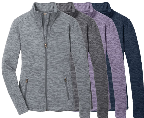
PORT AUTHORITY Ladies Digi Stripe Fleece Jacket L231 Women's Sizes: XS-4XL | 4 colors