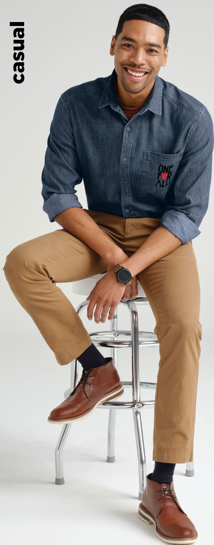
PORT AUTHORITY Long Sleeve Perfect Denim Shirt W676 Adult Sizes: XS-4XL | 2 colors