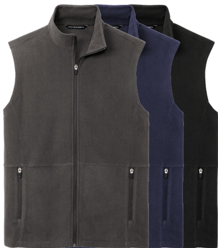
PORT AUTHORITY Accord Microfleece Vest F152 Adult Sizes: XS-4XL | 3 colors