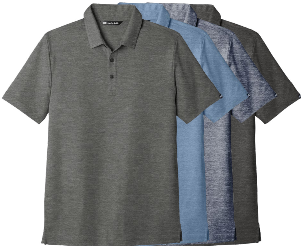
TRAVISMATHEW Oceanside Heather Polo TM1MU412 Adult Sizes: S-3XL | 8 colors