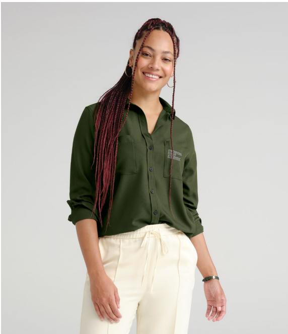
MERCER + METTLE Women's Stretch Crepe Long Sleeve Camp Blouse MM2013 Women's Sizes: XS-4XL | 4 colors