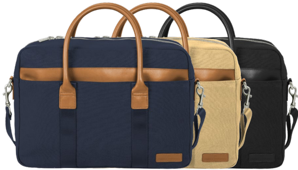
BROOKS BROTHERS Wells Briefcase BB18830 3 colors