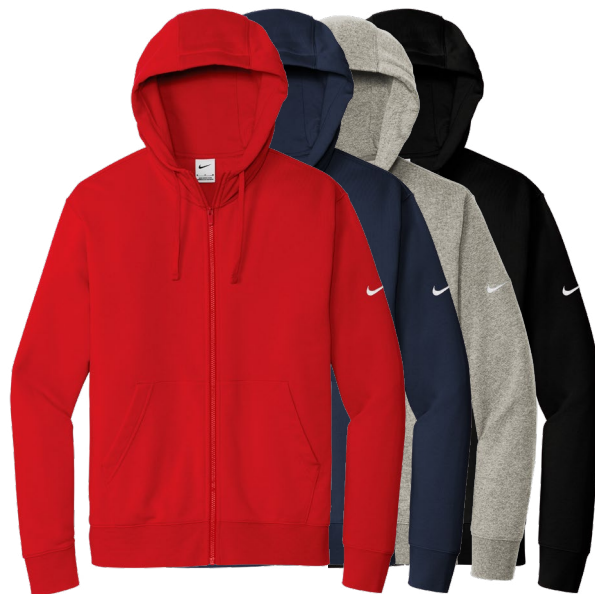
NIKE Club Fleece Sleeve Swoosh Full-Zip Hoodie NKDR1513 Adult Sizes: XS-4XL | 6 colors