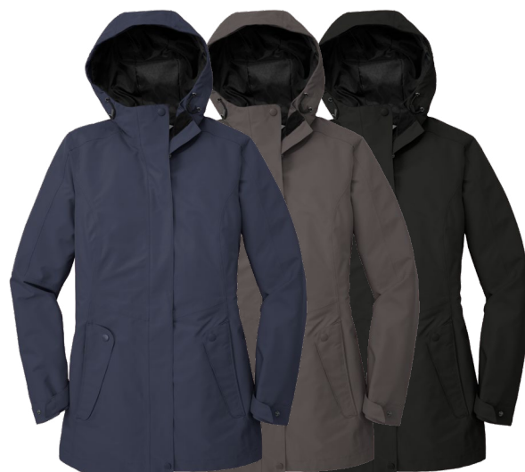
PORT AUTHORITY Ladies Collective Outer Shell Jacket L900 Women's Sizes: XS-4XL | 4 colors