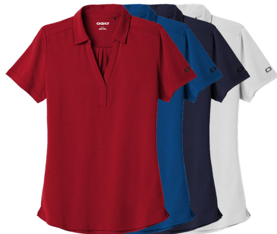
OGIO Ladies Limit Polo LOG138 Women's Sizes: XS-4XL | 7 colors