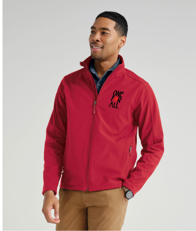
PORT AUTHORITY Core Soft Shell Jacket J317 Adult Sizes: XS-6XL | 11 colors Worn with W676