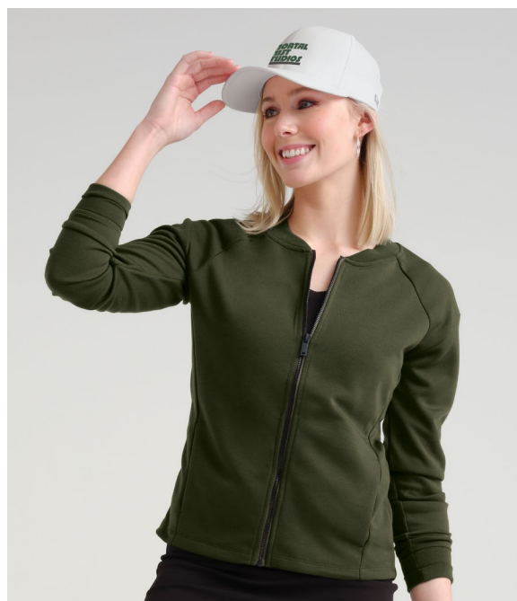
MERCER + METTLE Women's Double-Knit Bomber MM3001 Women's Sizes: XS-4XL | 4 colors Worn with TM1MU426

One size rarely fits all. A modern look represents a cohesive group that gives each member of the team the room to be themselves.