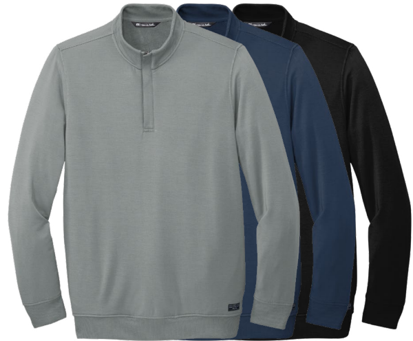
TRAVIS MATHEW Newport 1/4-Zip Fleece TM1MU419 Adult Sizes: S-3XL | 3 colors