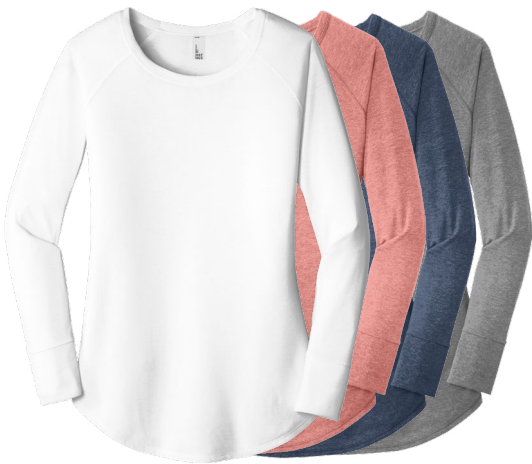
DISTRICT Women's Perfect Tri Long Sleeve Tunic Tee DT132L Women's Sizes: XS-4XL | 5 colors

Uplift the whole team with outfits that speak to a cohesive vision, a laid-back attitude and a clear focus on accomplishing great work together.