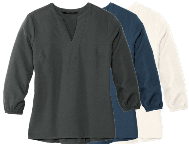
MERCER + METTLE Women's Stretch Crepe 3/4-Sleeve Blouse MM2011 Women's Sizes: XS-4XL | 5 colors