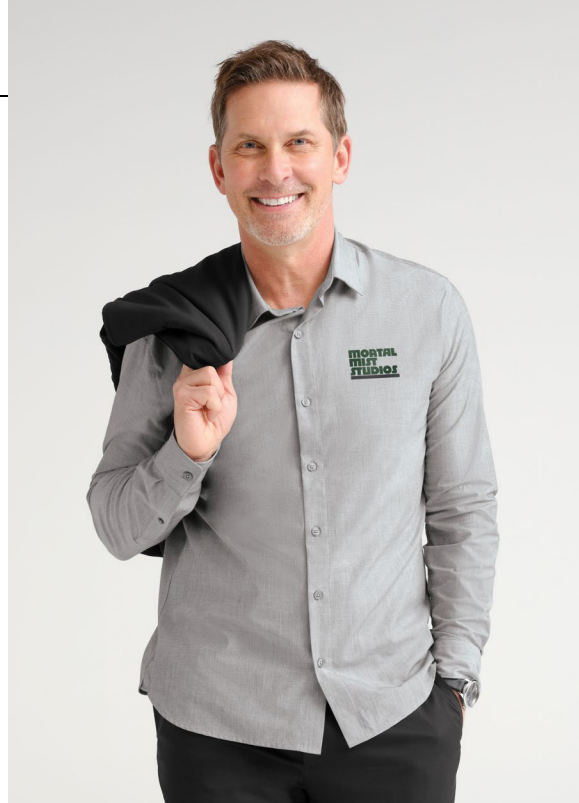
MERCER + METTLE Long Sleeve Stretch Woven Shirt MM2000 Adult Sizes: XS-4XL | 7 colors Worn with TM1MW453