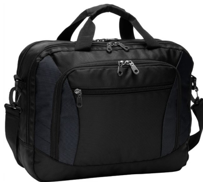
PORT AUTHORITY Commuter Brief BG307 1 color

Heat Transfer is the most effective technique for these styles