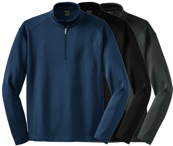
NIKE Sport Cover-Up 400099 Adult Sizes: XS-4XL | 3 colors