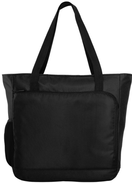
PORT AUTHORITY City Tote BG422 1 color