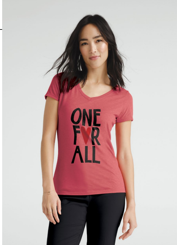
DISTRICT Women's Perfect Tri V-Neck Tee DM1350L Women's Sizes: XS-4XL | 23 colors