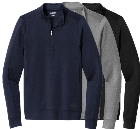
OGIO Luuma 1/2-Zip Fleece OG813 Adult Sizes: XS-4XL | 3 colors