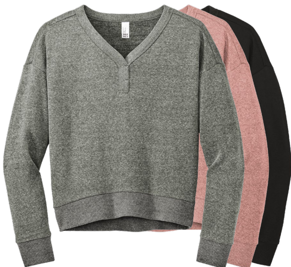
DISTRICT Ladies Perfect Tri Fleece V-Neck Sweatshirt DT1312 Women's Sizes: XS-4XL | 5 colors