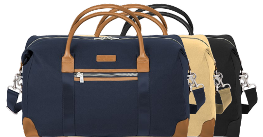
BROOKS BROTHERS Wells Duffel BB18880 3 colors