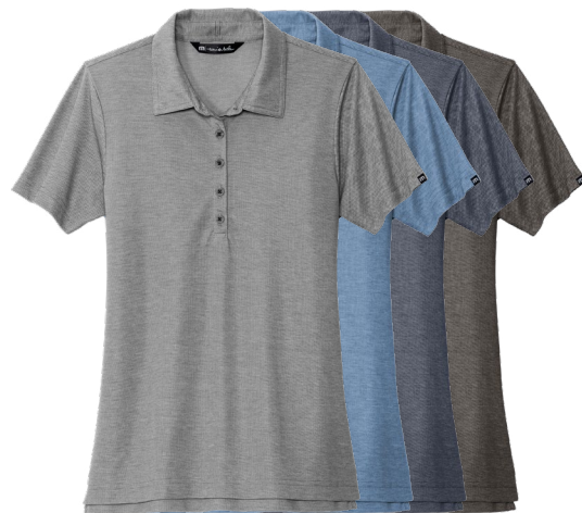
TRAVISMATHEW Ladies Oceanside Heather Polo TM1WW002 Women's Sizes: S-2XL | 6 colors