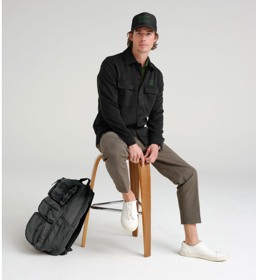
OGIO Utilitarian Modular Pack 91018 2 colors