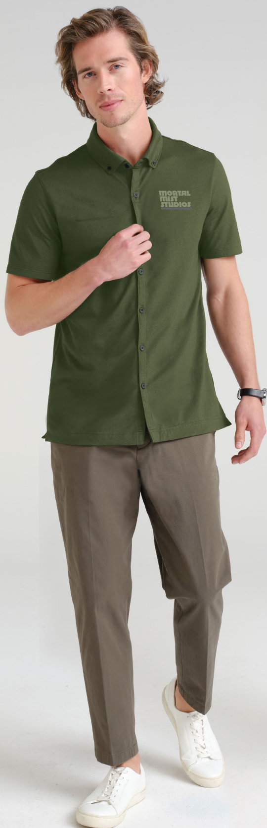
MERCER + METTLE Stretch Pique Full-Button Polo MM1006 Adult Sizes: XS-4XL | 7 colors