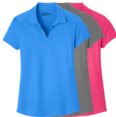
NIKE Ladies Dri-FIT Legacy Polo 838957 Women's Sizes: XS-2XL | 6 colors