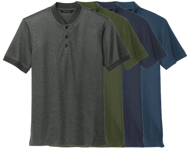
MERCER + METTLE Stretch Pique Henley MM1008 Adult Sizes: XS-4XL | 7 colors