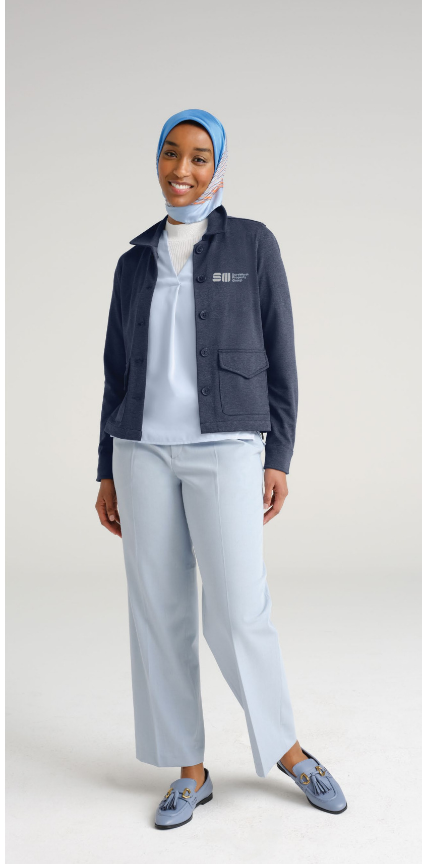
BROOKS BROTHERS Women's Mid-Layer Stretch Button Jacket BB18205 Women's Sizes: XS-4XL | 3 colors Worn with BB18009