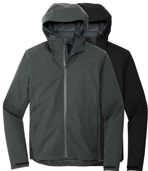
MERCER + METTLE Waterproof Rain Shell MM7000 Adult Sizes: XS-4XL | 2 colors