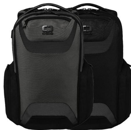
OGIO Connected Pack 91008 2 colors