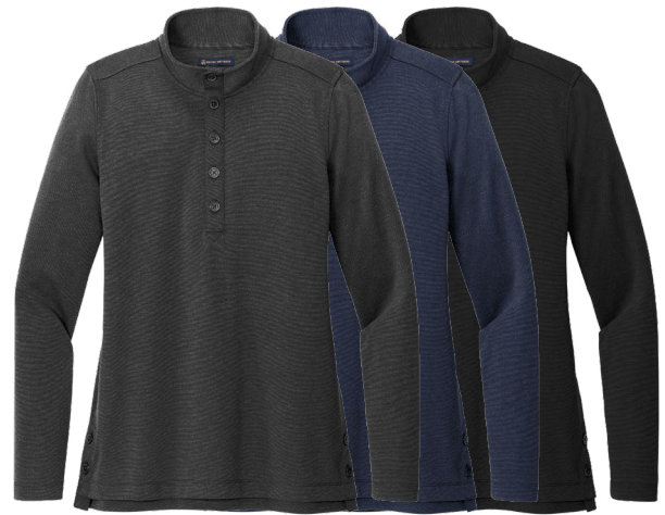
BROOKS BROTHERS Women's Mid-Layer Stretch 1/2 Button BB18203 Women's Sizes: XS-4XL | 3 colors