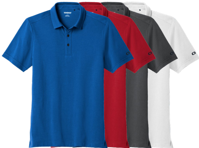
OGIO Limit Polo OG138 Adult Sizes: XS-4XL | 6 colors