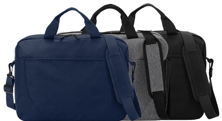
PORT AUTHORITY Access Briefcase BG318 3 colors