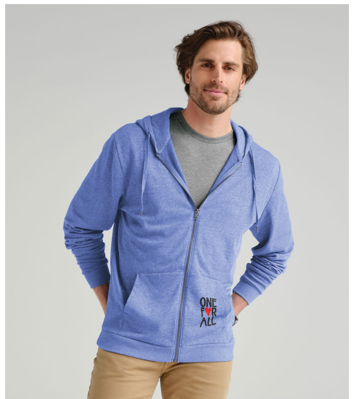
DISTRICT Perfect Tri Fleece Full-Zip Hoodie DT1302 Adult Sizes: XS-4XL | 6 colors Worn with DM130