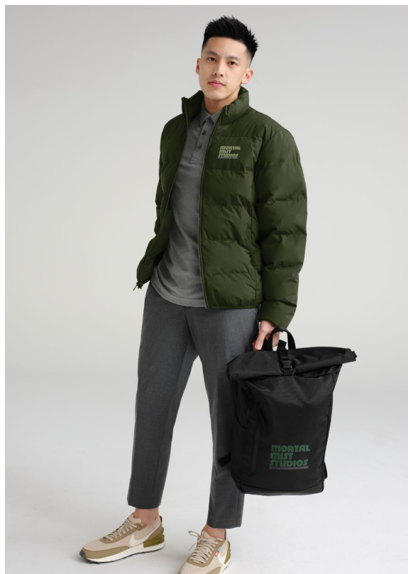
MERCER + METTLE Rucksack MMB201 One Size Fits All | 1 color Worn with TM1MU412, MM7210