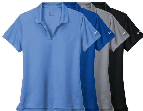
NIKE Ladies Dri-FIT Micro Pique 2.0 Polo NKDC1991 Women's Sizes: S-2XL | 20 colors