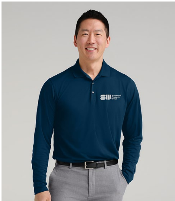
NIKE Dri-FIT Micro Pique 2.0 Long Sleeve Polo NKDC2104 Adult Sizes: XS-4XL | 7 colors