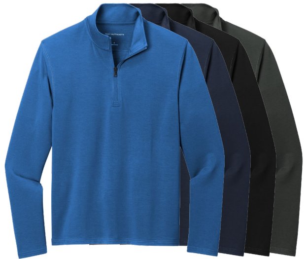
PORT AUTHORITY Microterry 1/4-Zip Pullover K825 Adult Sizes: XS-4XL | 4 colors