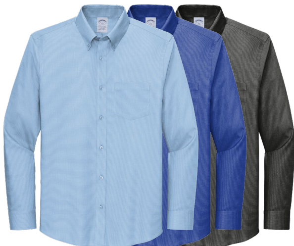
BROOKS BROTHERS Wrinkle Free Stretch Nailhead Shirt BB18002 Adult Sizes: XS-4XL | 6 colors