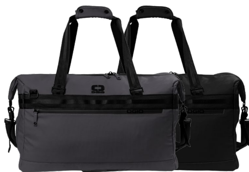
OGIO Commuter Duffel 411098 2 colors