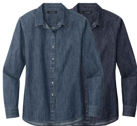
PORT AUTHORITY Ladies Long Sleeve Perfect Denim Shirt LW676 Women's Sizes: XS-4XL | 2 colors