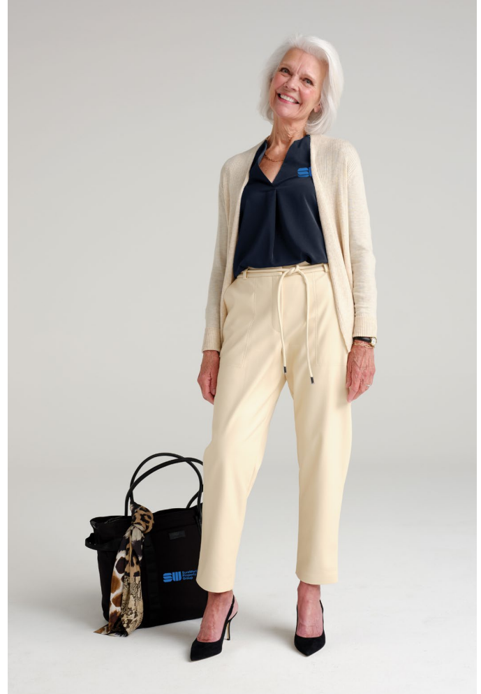
BROOKS BROTHERS Wells Laptop Tote BB18840 2 colors Worn with BB18009, LSW289