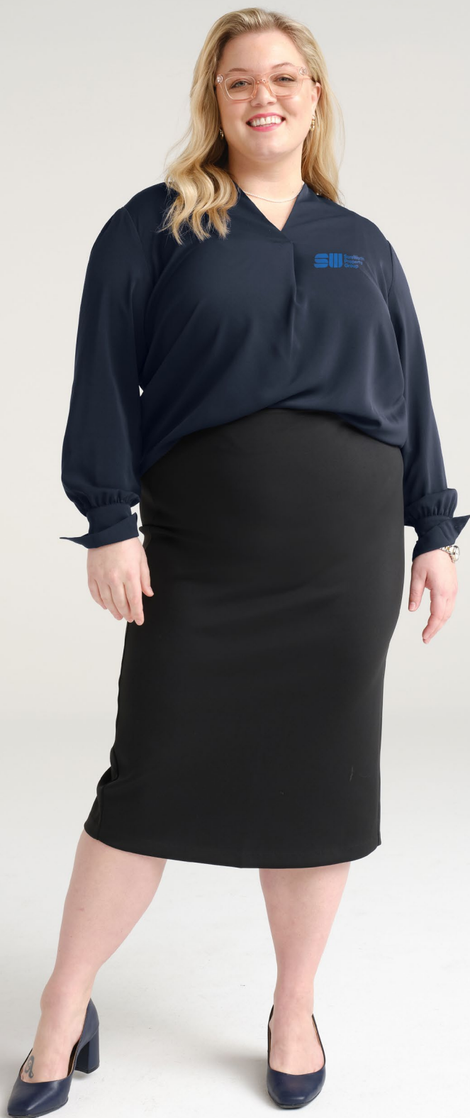
BROOKS BROTHERS Women's Open-Neck Satin Blouse BB18009 Women's Sizes: XS-4XL | 4 colors

Buttoned-up should not mean boring. A true classic look brings the team together with a sense of professionalism and pride.