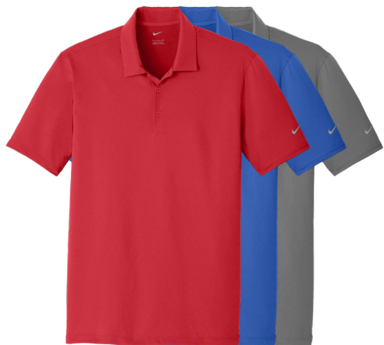
NIKE Dri-FIT Legacy Polo 883681 Adult Sizes: XS-4XL | 6 colors