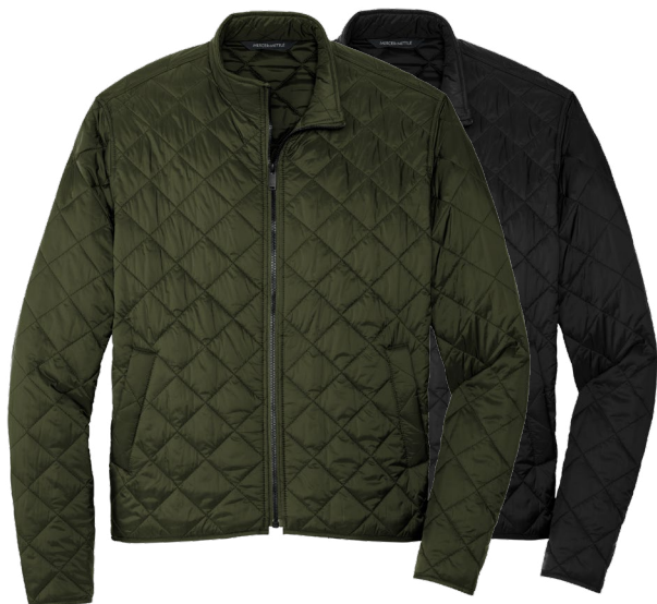
MERCER + METTLE Quilted Full-Zip Jacket MM7200 Adult Sizes: XS-3XL | 2 colors