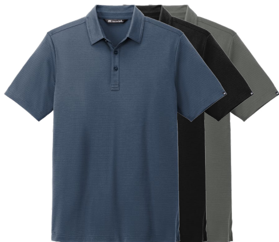
TRAVIS MATHEW Bayfront Solid Polo TM1MY399 Adult Sizes: S-3XL | 4 colors