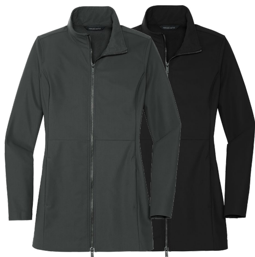
MERCER + METTLE Women's Faile Soft Shell MM7101 Women's Sizes: XS-4XL | 2 colors