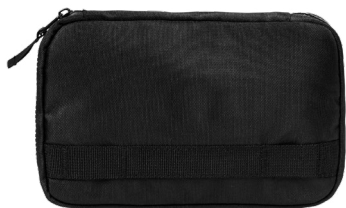
MERCER + METTLE Utility Case MMB700 1 color