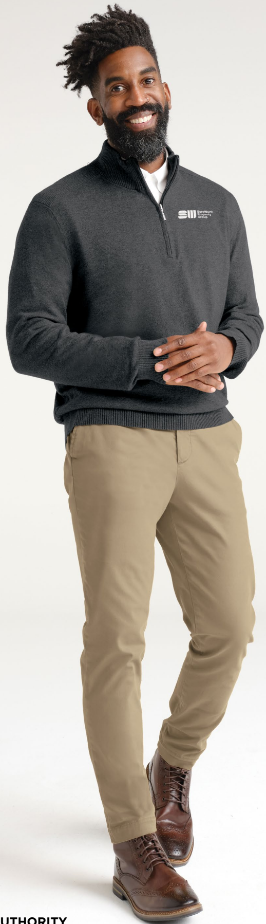
PORT AUTHORITY 1/2-Zip Sweater SW290 Adult Sizes: XS-4XL | 3 colors Worn with BB18002