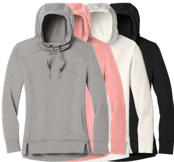
OGIO Ladies Luuma Pullover Fleece Hoodie LOG810 Women's Sizes: XS-4XL | 4 colors