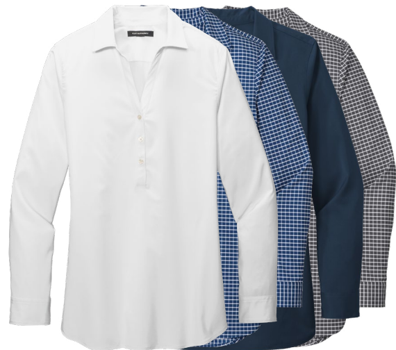
PORT AUTHORITY Ladies City Stretch Tunic LW680 Women's Sizes: XS-4XL | 5 colors