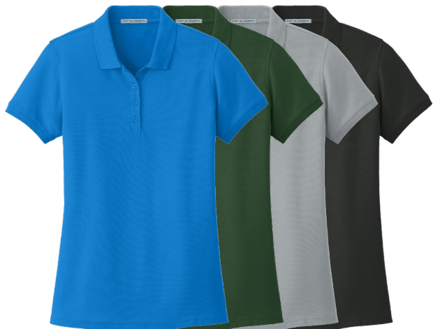
PORT AUTHORITY Ladies Core Classic Pique Polo L100 Women's Sizes: XS-6XL | 13 colors