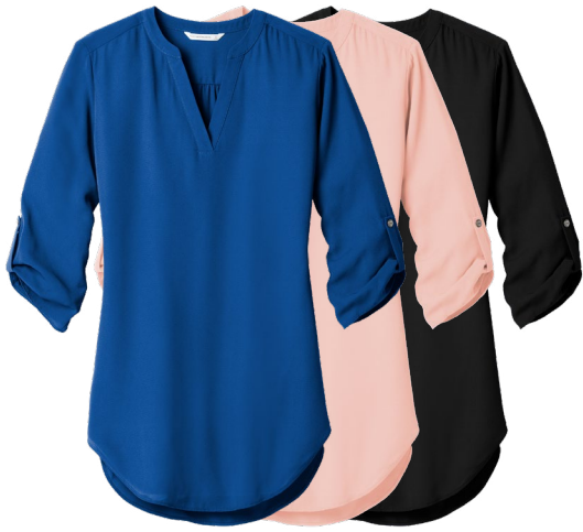
PORT AUTHORITY Ladies 3/4-Sleeve Tunic Blouse LW701 Women's Sizes: XS-4XL | 8 colors

Uplift the whole team with outfits that speak to a cohesive vision, a laid-back attitude and a clear focus on accomplishing great work together.