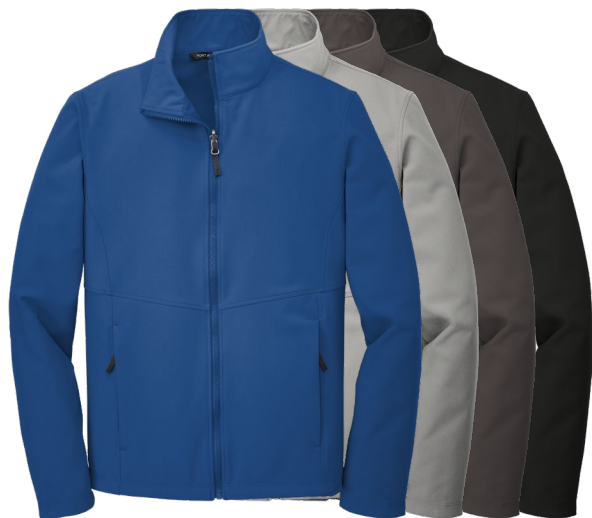
PORT AUTHORITY Collective Soft Shell Jacket J901 Adult Sizes: XS-4XL | 5 colors