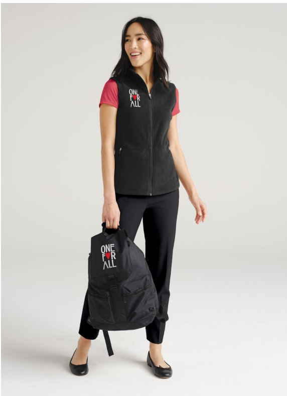
OGIO Evolution Pack 91015 4 colors