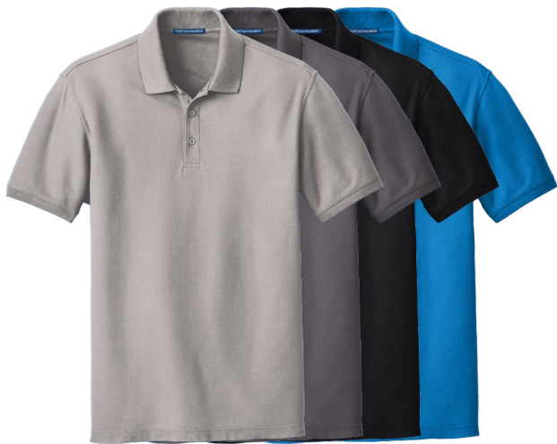
PORT AUTHORITY Core Classic Pique Polo K100 Adult Sizes: XS-6XL | 12 colors