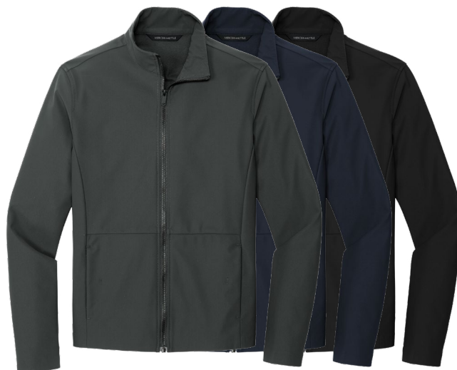
MERCER + METTLE Faile Soft Shell MM7100 Adult Sizes: XS-4XL | 3 colors