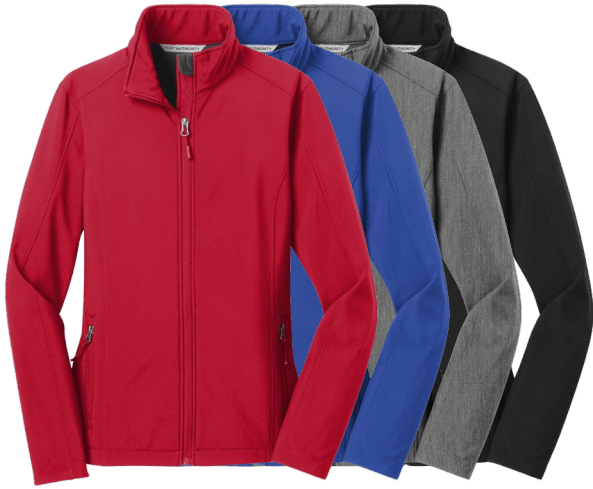
PORT AUTHORITY Ladies Core Soft Shell Jacket L317 Women's Sizes: XS-4XL | 10 colors