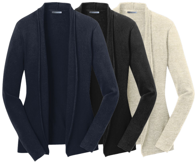
PORT AUTHORITY Ladies Open Front Cardigan Sweater LSW289 Women's Sizes: XS-4XL | 4 colors