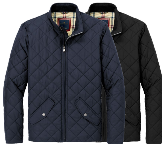
BROOKS BROTHERS Quilted Jacket BB18600 Adult Sizes: XS-4XL | 2 colors