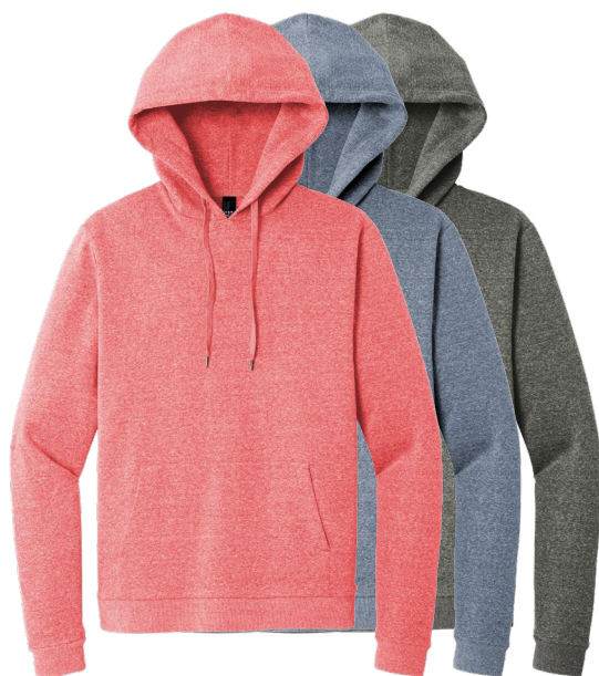
DISTRICT Perfect Tri Fleece Pullover Hoodie DT1300 Adult Sizes: XS-4XL | 12 colors