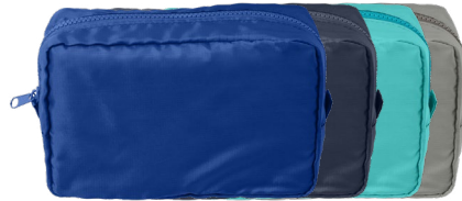
PORT AUTHORITY Stash Dimensional Pouch BG916 6 colors