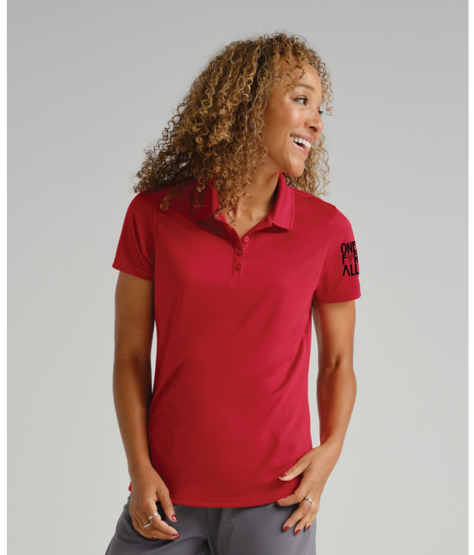
PORT AUTHORITY Ladies Dry Zone UV Micro-Mesh Polo LK110 Women's Sizes: XS-4XL | 16 colors