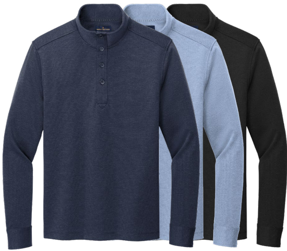
BROOKS BROTHERS Mid-Layer Stretch 1/2 Button BB18202 Adult Sizes: XS-4XL | 5 colors