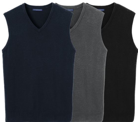
PORT AUTHORITY Sweater Vest SW286 Adult Sizes: XS-4XL | 3 colors