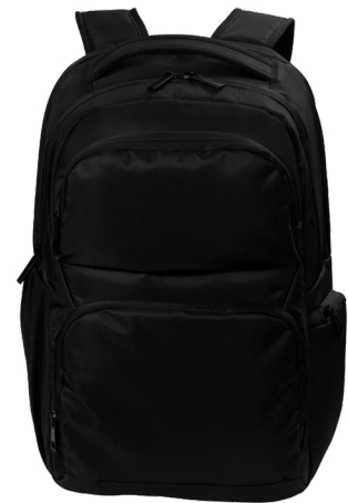
PORT AUTHORITY Transit Backpack BG224 1 color