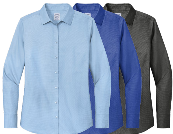
BROOKS BROTHERS Wrinkle Free Women's Stretch Nailhead Shirt BB18003 Women's Sizes: XS-4XL | 6 colors