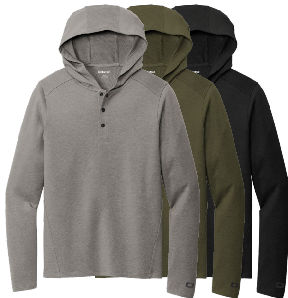
OGIO Luuma Flex Hooded Henley OG826 Adult Sizes: XS-4XL | 3 colors