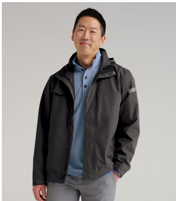
PORT AUTHORITY Collective Outer Shell Jacket J900 Adult Sizes: XS-4XL | 4 colors Worn with NKDC2104, BB18202