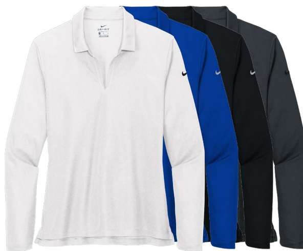
NIKE Ladies Dri-FIT Micro Pique 2.0 Long Sleeve Polo NKDC2105 Women's Sizes: S-2XL | 7 colors