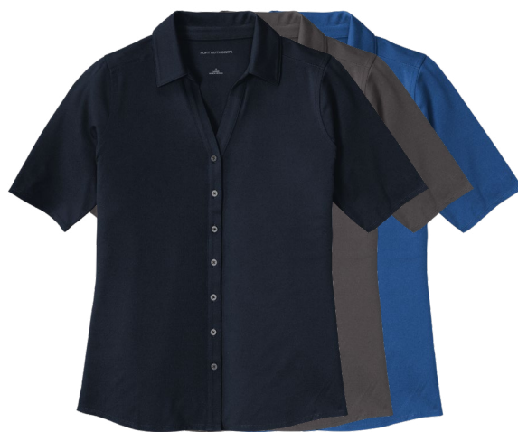
PORT AUTHORITY Ladies City Stretch Top LK682 Women's Sizes: XS-4XL | 5 colors