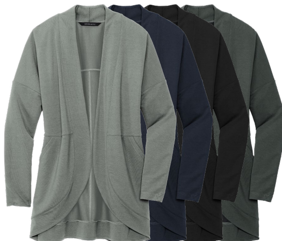
MERCER + METTLE Women's Stretch Open-Front Cardigan MM3015 Women's Sizes: XS-4XL | 4 colors