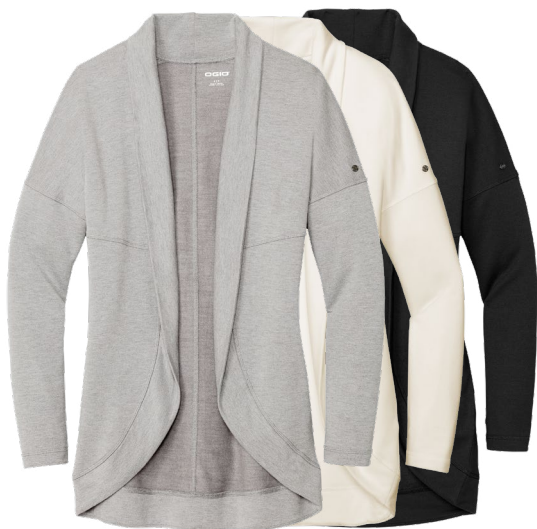
OGIO Ladies Luuma Coccoon Fleece LOG811 Women's Sizes: XS-4XL | 3 colors