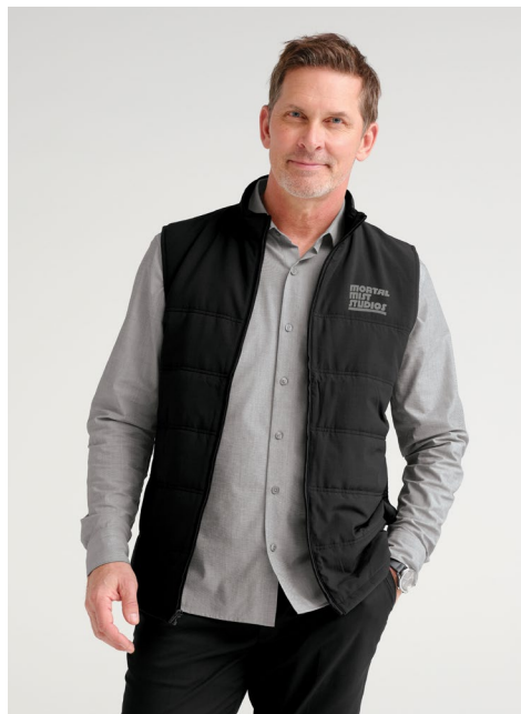
TRAVIS MATHEW Cold Bay Vest TM1MW453 Adult Sizes: S-3XL | 2 colors Worn with MM2000