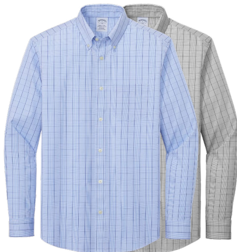
BROOKS BROTHERS Wrinkle Free Stretch Patterned Shirt BB18008 Adult Sizes: XS-4XL | 2 colors

Buttoned-up should not mean boring. A true classic look brings the team together with a sense of professionalism and pride.