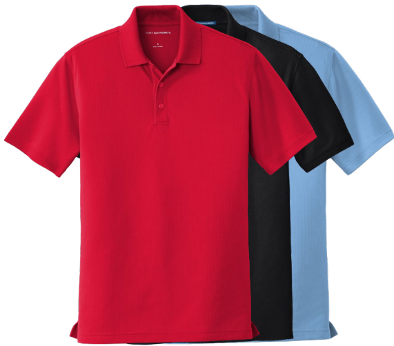
PORT AUTHORITY Dry Zone UV Micro-Mesh Polo K110 Adult Sizes: XS-6XL | 16 colors