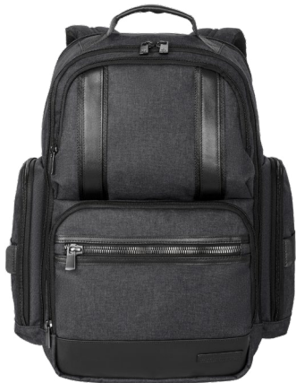
BROOKS BROTHERS Grant Backpack BB18820 1 color

Heat Transfer is the most effective technique for these styles